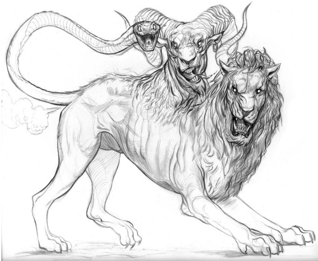
Figure 2: Chimera