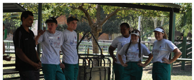
OPVSC hopes to see many new veterinary science students next year.