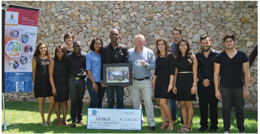
Both VetSCO and the Faculty express their gratitude to CEVA for the sponsorship.