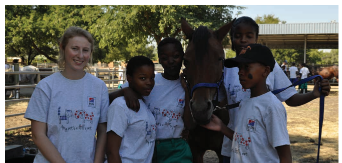
Learners got to interact with the animals on campus.