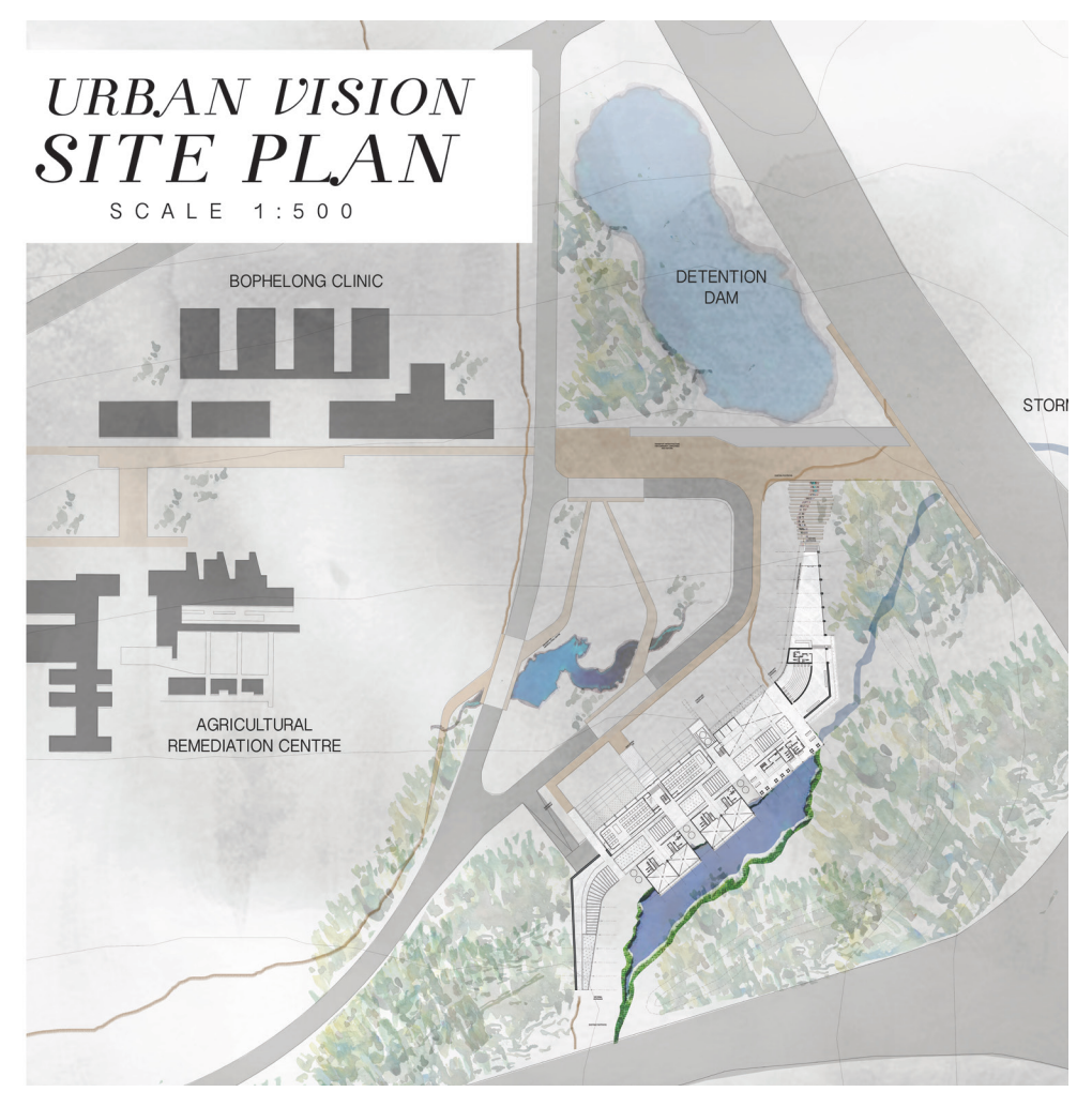
Figure 2.1: Urban vision planning to address the issues of land, water and health (Author, 2016)

The urban vision also addresses a much needed clinic for the adjacent township Bophelong, as well as an agricultural soil remediation Centre that will provide the Vaal Triangle industries with environmental remediation support.