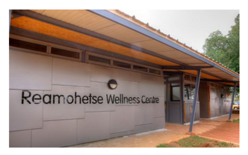
Figure 2.1: Sebokeng Wellness Centre/Clinic. (news&media, 2013)

The Participatory Action Research Report in 2015 brought a different perspective. The report focuses on women affected by the impacts of the steel industry (Vaal Environmental Justice Alliance, 2015). The women's major concerns related to the toxic environmental conditions while working at, and living close to the steel works, was the loss of the men of the community due to sickness, disability or death.