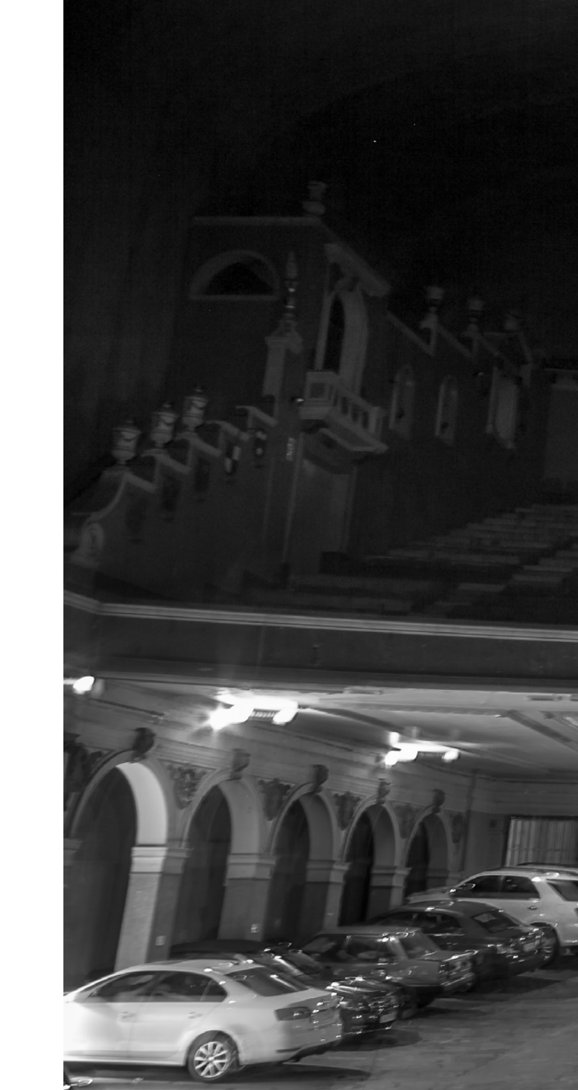
Fig. 5: (Right) The auditorium space is currently being used as parking garage since 1981 (Author, 2016). Refer to Context chapter.

Fig. 4: (Previous page) The Grand Foyer, as referred to by the proposal drawings, in its current condition (Author, 2016). This area as well as the adjacent spaces are relatively well maintained when compared to the auditorium space. (Pictured right) Events, private and restaurant hosted extent from the Entrance Foyer into the Grand Foyer and the adjacent spaces.