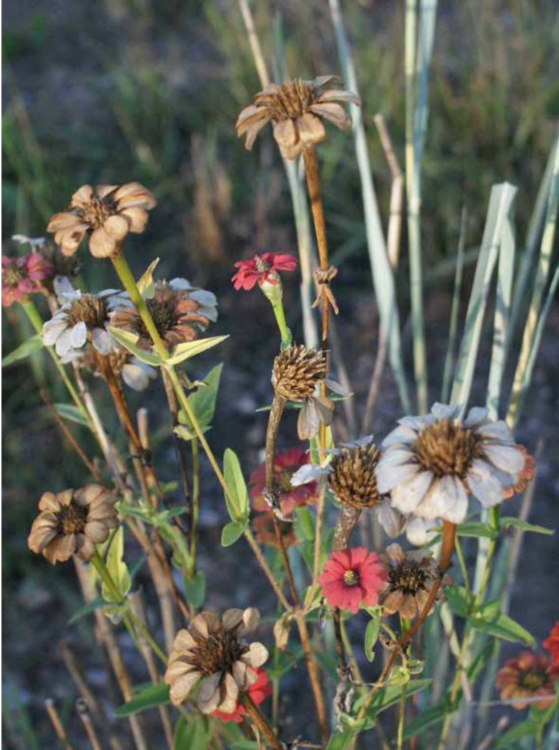
▲ FIGURE 2.7 WILDFLOWERS ON BOLT'S FARM