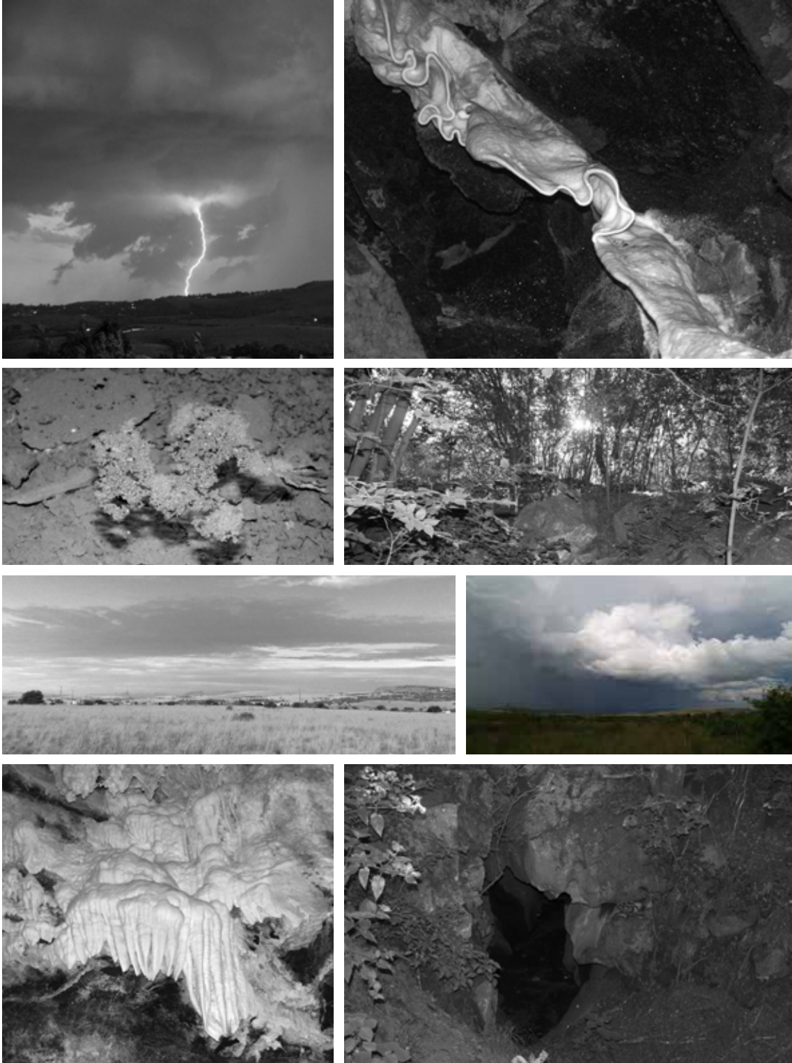
▲ FIGURE 2.5 KARST NETWORK (Krige, G , 2016)