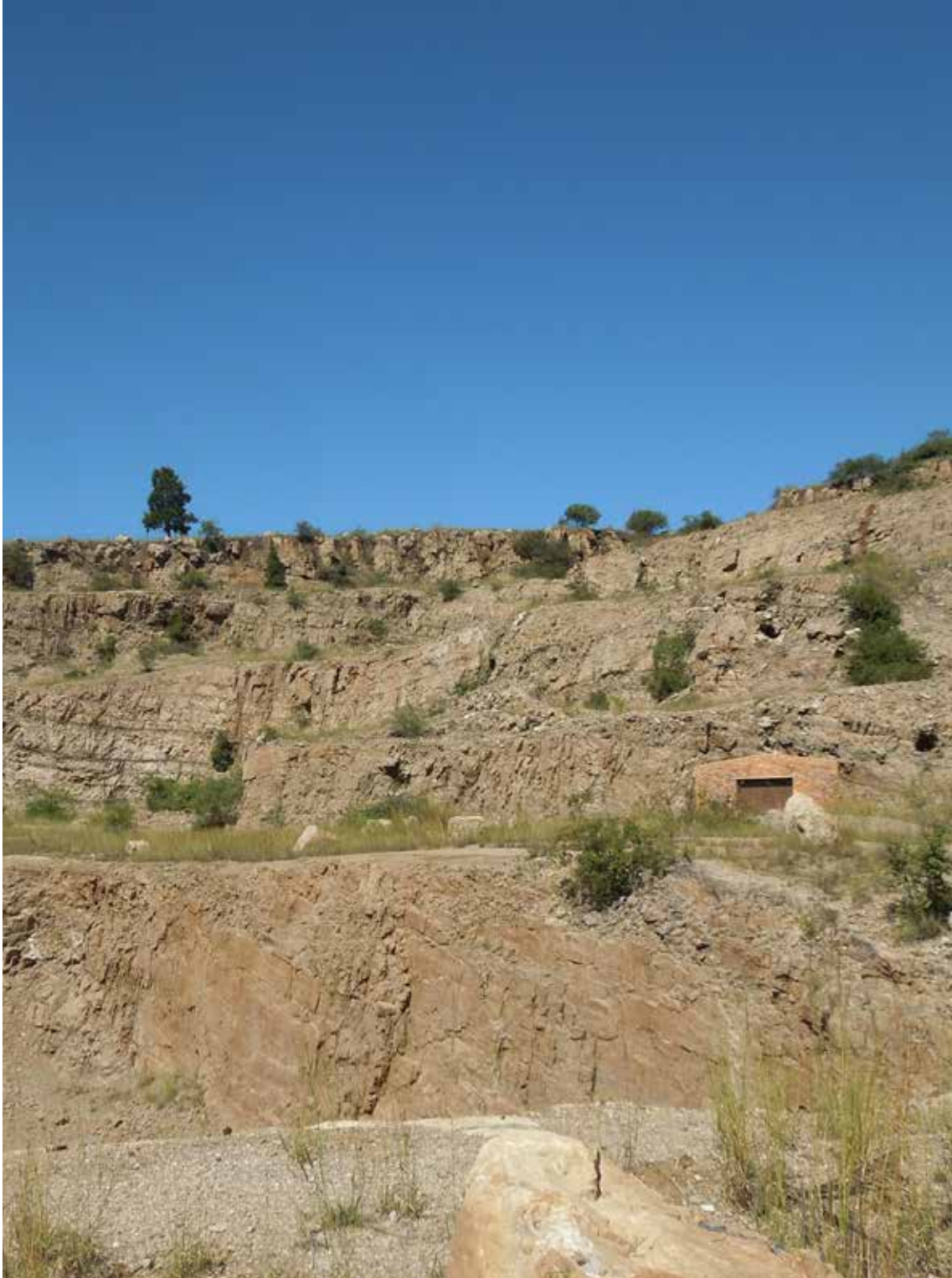
▲ FIGURE 2.4 ENTRANCE TO ALLADIN'S CAVE (Author , 2016)