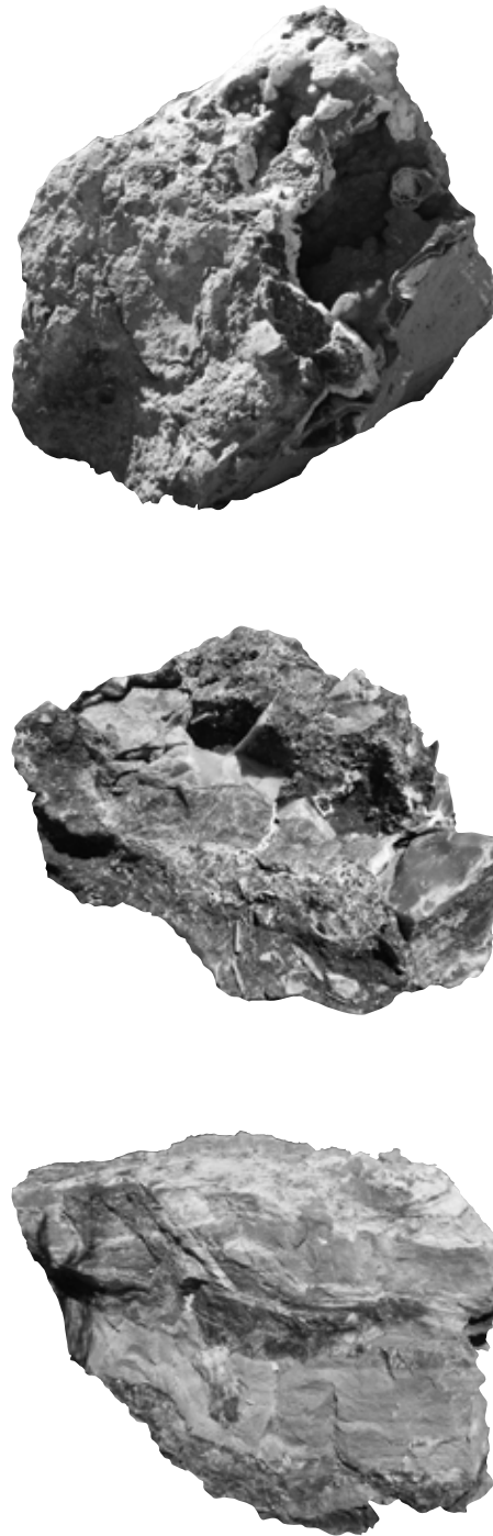
▶ FIGURE 2.3 STONES FROM QUARRY (Author , 2016)