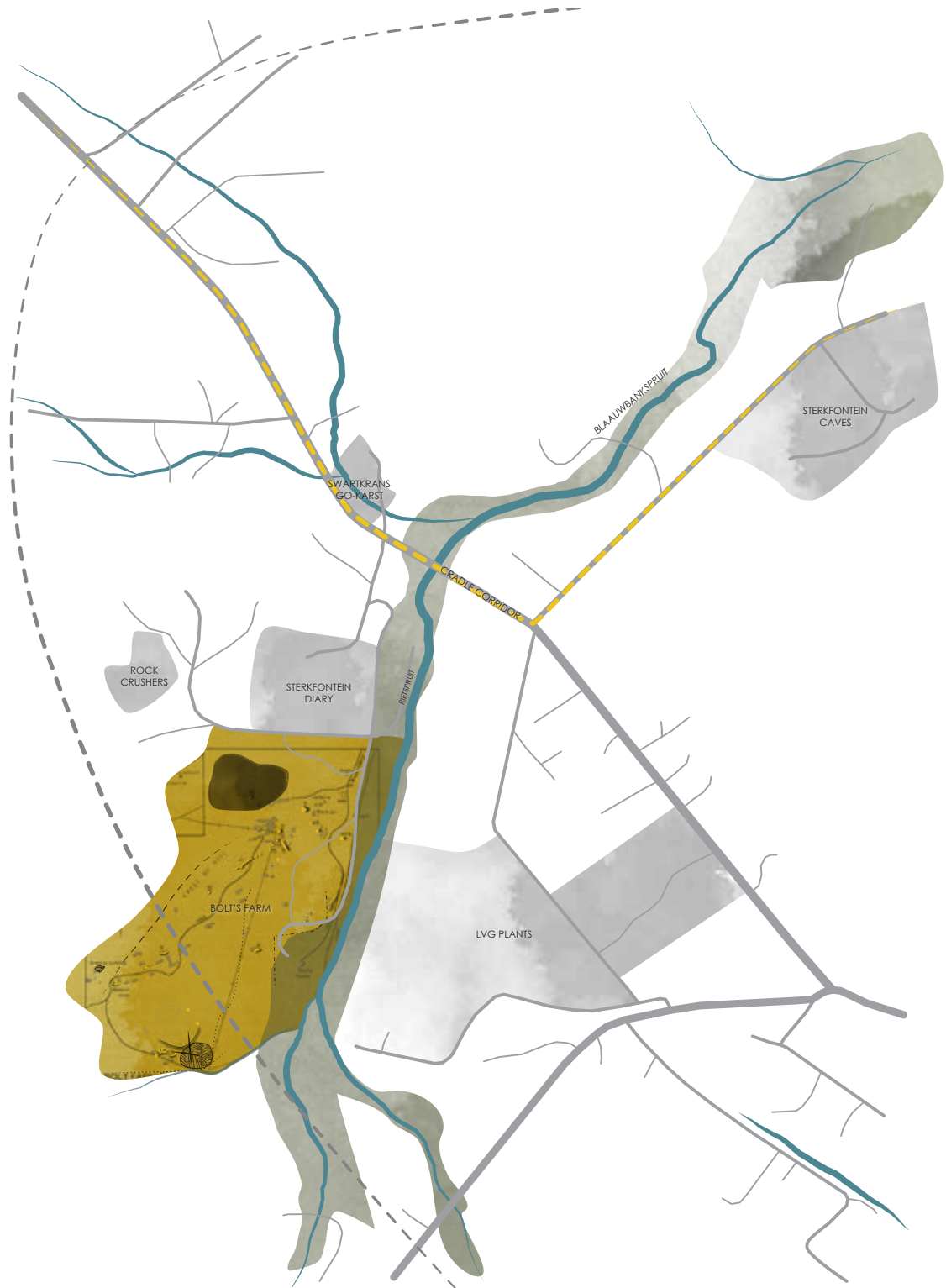
▲ FIGURE 2.1 BOLT'S FARM LOCATION (Author , 2016)