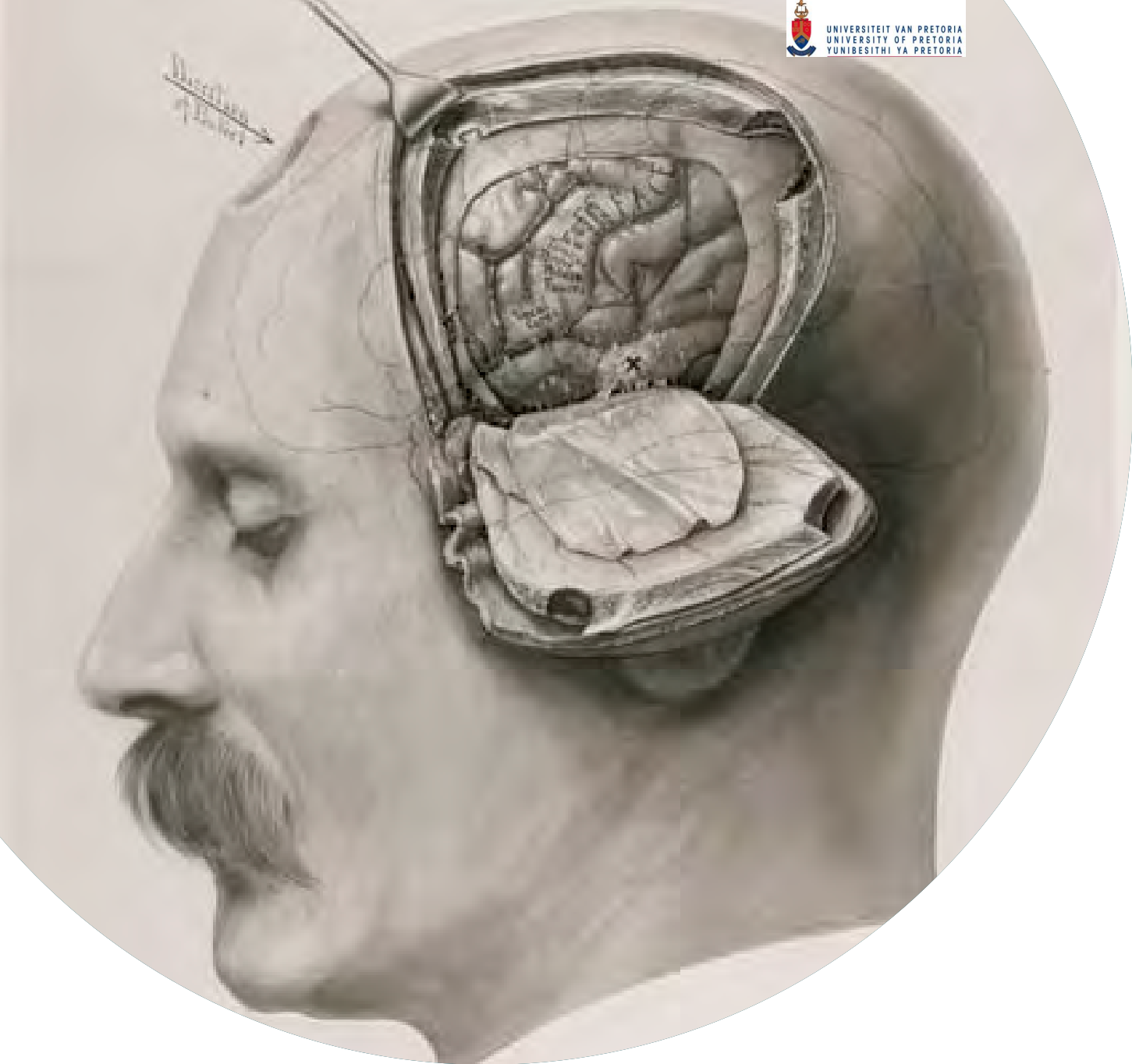
Figure 7: The brain (Brodel 2014)