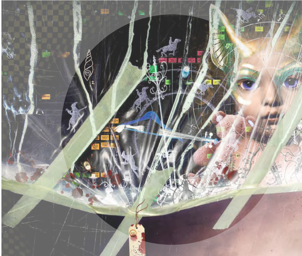
Figure 7.4: Memory (Safi 2015)