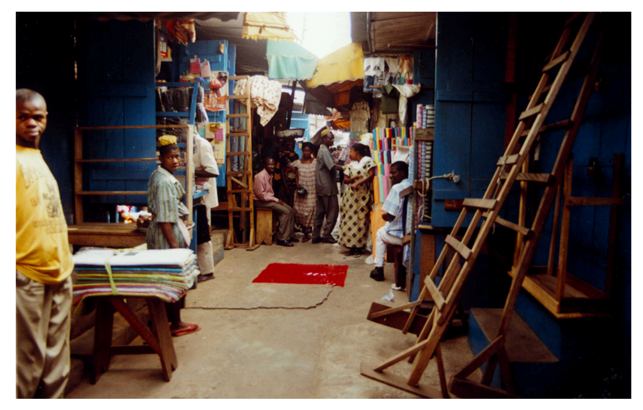
FIGURE 1: listening kumasi : Performative intervention Central Market Kumasi, 2002, © Bärbel Müller

period, one square metre of red fabric – as a space-generating tool, metric system, and ex-territorial architectonic space - was implemented at each point and field. In addition to spatial facts, cultural and social behaviour became perceivable, and short-term spaces of communication were revealed.