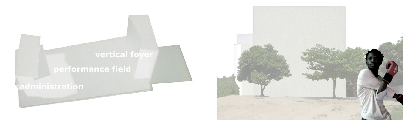
FIGURE 6: Studios Kabako Makiso: design for a small performance centre, architect: Bärbel Müller

In Makiso , the administrative and economic centre of Kisangani, the representational aspects of Studio Kabako will converge, both on a programmatic and on an architectonic level. It is the place for showing work, it is meant to be a stage that communicates with the city and the outer world, a space that is open to the city and allows the city to come in. Events, concerts, and projections shall take place. This centre is designed to become the landmark of Studios Kabako, the sign leading into the city, which is reflected in its architecture.