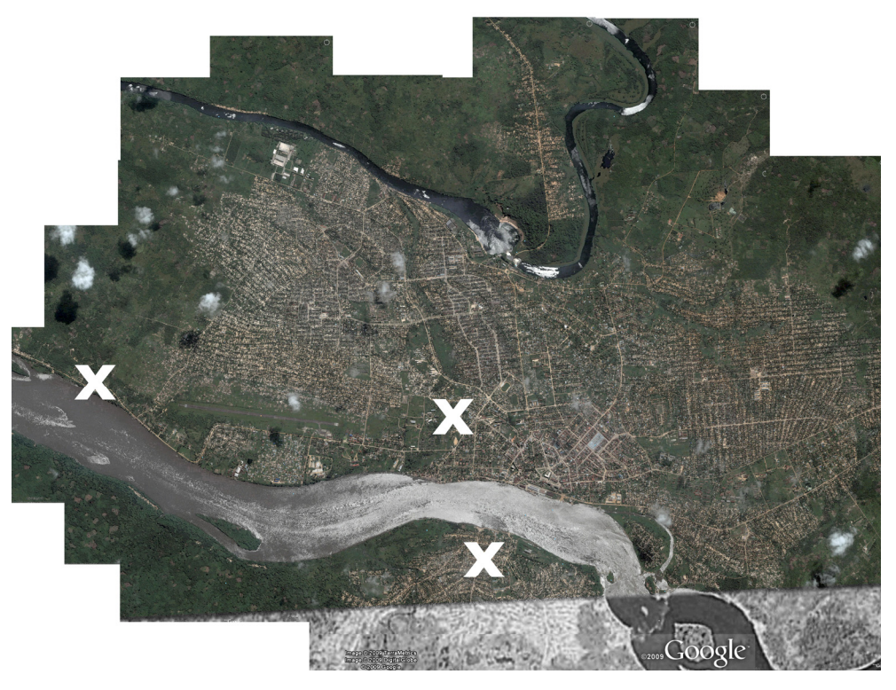
FIGURE 5: Kisangani map based on Google Earth, Image © 2009 TerraMetrics, Image © 2009 DigitalGlobe © 2009 Google, © 2009, and: acupuncturing the city

The concept of decentralization is essential towards understanding how Studios Kabako operates on all levels – from its choreographic details in staged dance and theatre pieces, to its strategic plans for urban appropriations. Even the question of "why Kisangani, not Kinshasa?", aside from personal reasons, is argued for with the strong conviction of contributing to the decentralization of cultural life and the Congolese art scene, which, until now, has been focused on Kinshasa (and towards Europe), in order to bring back the focus to one of the province cities of the Congo.