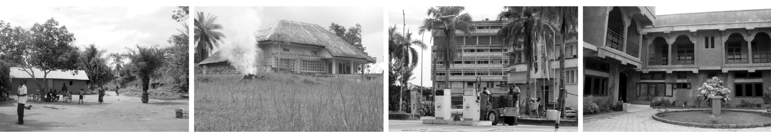
FIGURE 4: Kisangani: vernacular, Belgian-colonial, Modernistic and contemporary structures

What else characterizes the city at first glance? The movements of people - walking, cycling, carrying goods; the flow of the two rivers embracing the city, silent and powerful at the same time; the strong presence of history or a plurality of histories which define(s) the identity/ identities of the city: all have left their explicit physical and mental traces.