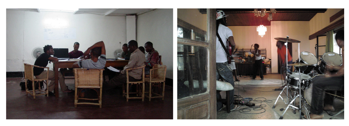
FIGURE 8: Studios Kabako film workshop 2008 in a rented space / rehearsal of the piece more more more... future in the living room of a rented house