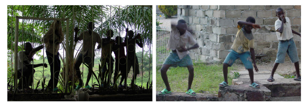
FIGURE 9: Studios Kabako: rehearsals of the piece more more more... future with audience participation