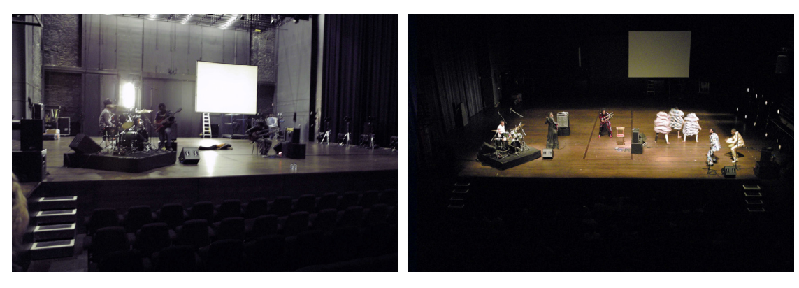
FIGURE 10: Studios Kabako: rehearsals and performance of the piece more more more... future in the KVS Theater in Brussels