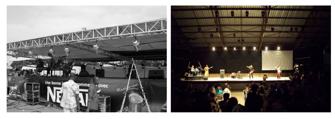
FIGURE 11: Studios Kabako: stage set-up in Bandal, Kinshasa, and a performance of the piece more more more... future in the French Cultural Centre in Kinshasa