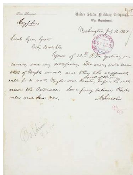
Figure 3: An archival document