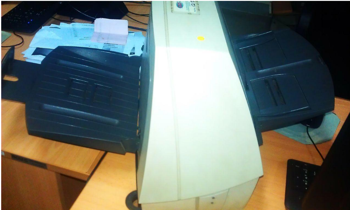
Figure 5: Kodak Automatic Document Feeder