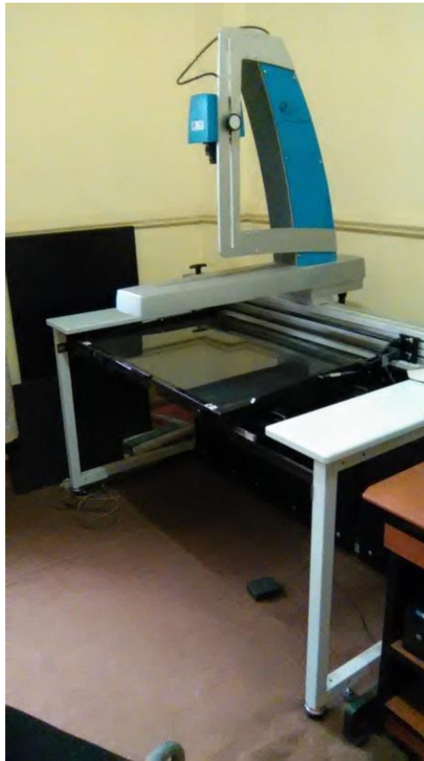
Figure 4: Digibook SupraScan II