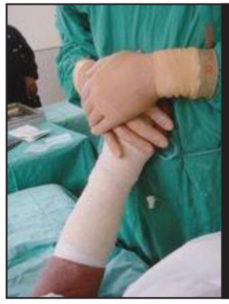
Figure 4. A volar POP slab is applied with the fingers and palm in full extension. Pressure is applied for 5 minutes after the tourniquet is released while the POP hardens.