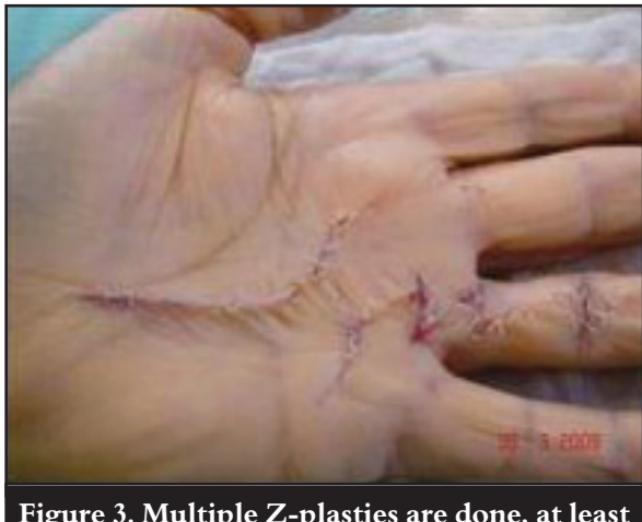
Figure 3. Multiple Z-plasties are done, at least over skin folds.

An indication for surgery was when a finger or fingers caused interference with work or activities of daily living due to the flexion contracture