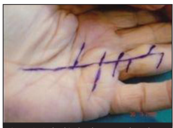
Figure 2. Only skin hooks are used to elevate and retract skin.