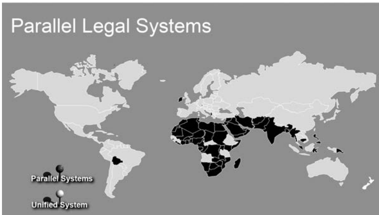
Map 2—Countries with Plural Legal Systems

Plural legal systems are not recorded in degree but as a dichotomous variable. Map 2 shows countries that have plural legal systems. As can be seen, a majority of those countries recorded as having a plural legal system are in Africa, but countries with plural legal systems also include, among others, India, Pakistan, Bangladesh, Afghanistan, Indonesia, Iran, Iraq, Albania, Cambodia, Ireland, and Israel.