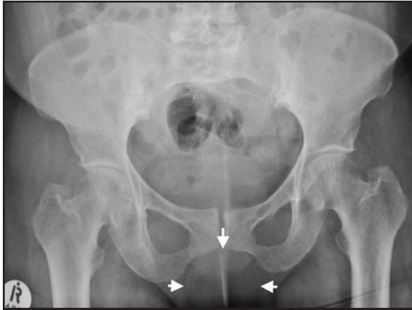
Figure 1. Antero-posterior plain pelvic radiograph shows well-circumscribed soft tissue mass just below the pubic symphysis.