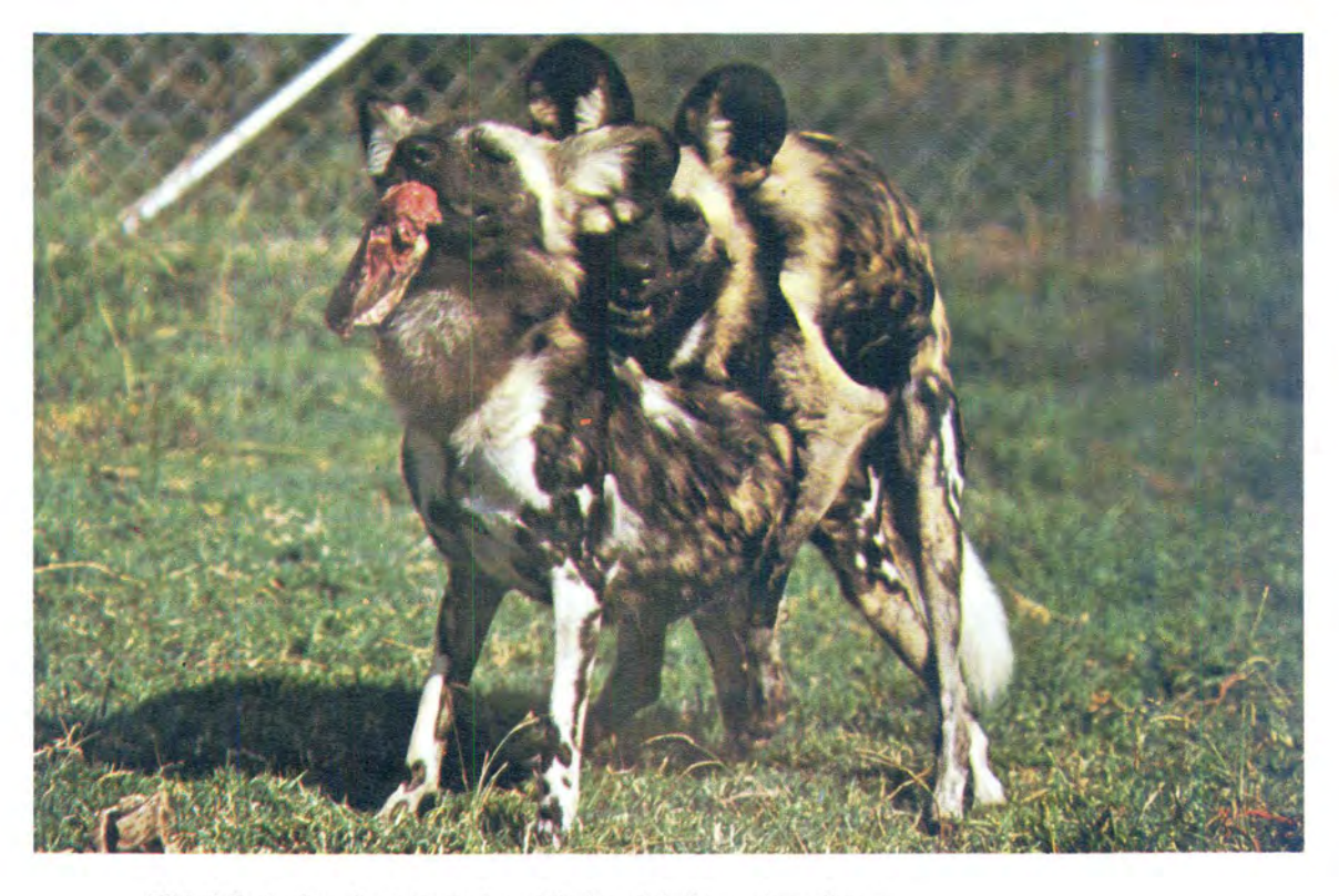
FIG. 2 Beginning of a true mating while female holds a piece of meat