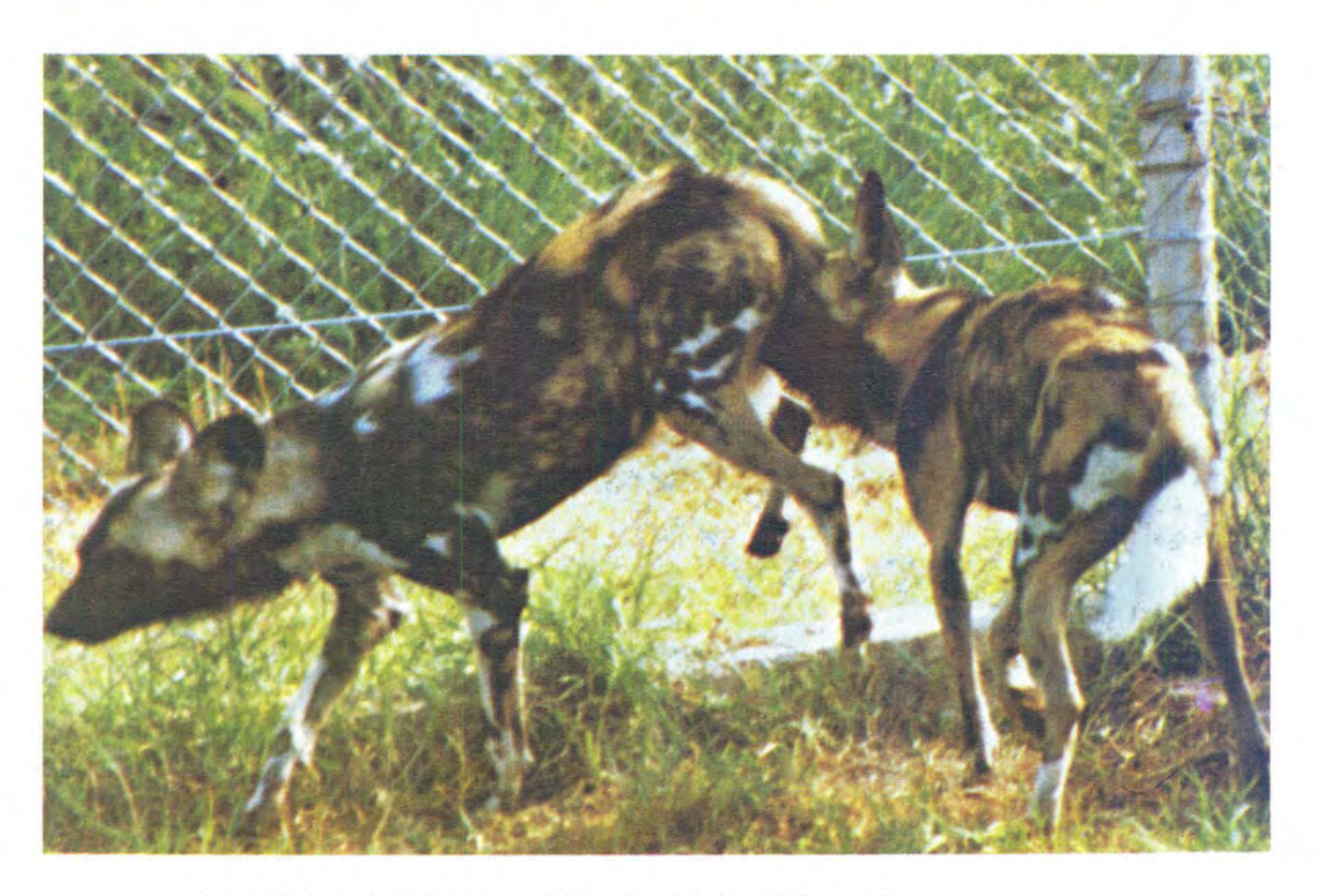
FIG. 1 Male L. pictus licking and lifting the genital area of a female