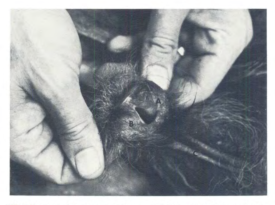
FIG. 6 Distal end of the praeputium with some of the hair cut away to demonstrate the triangular orifice, the ventrolateral walls at the praeputial orifice A and B and the 2 skin folds C connecting the praeputium to the ventral body wall. The animal is in lateral recumbency with its head towards the left side of the photograph.