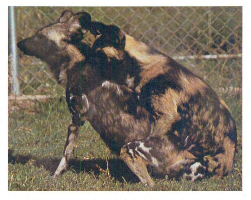
FIG. 4 During the copulatory tie the male sits behind the female