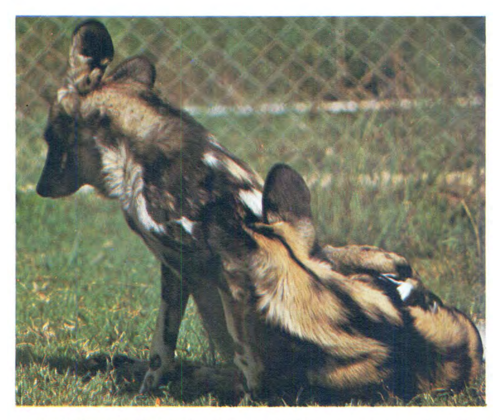
FIG. 5 The male lies behind the female during the copulatory tie. The ulcerative lesion at the base of the left ear of the female is just visible