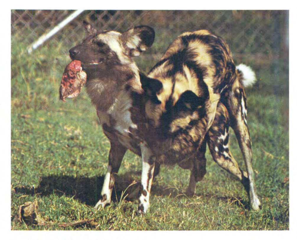
FIG. 3 Male in the mounted position