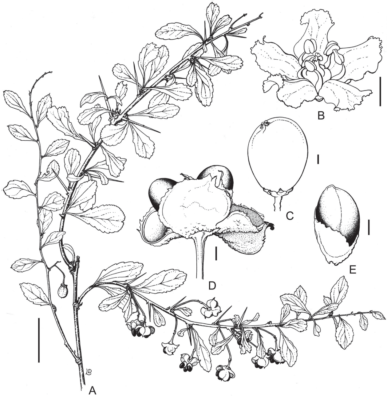
FIGURE 1. Gymnosporia swazica . A. Fruiting branch (from Jordaan 3845 ). B. Female flower (from Ward 1507 ). C. Open capsule (from Jordaan 3845 ). D. Closed capsule (from Jordaan 3712 ). E. Seed, partially covered by the aril (from Jordaan 3845 ). Drawings by Lesley Deyssel. Scale bar: A = 20 mm, B–E = 1 mm.

Small tree up to 3 m tall, usually single-stemmed, sometimes multi-stemmed, few-branched with longer branches drooping at ends, glabrous; branchlets angular, green, becoming dark grey, without lenticels. Thorns axillary, slender, up to 15 mm long. Brachyblasts up to 4 mm long. Leaves chartaceous, concolourous; lamina obovate to spatulate, 10–20(–45) × 5–10(–15) mm, apex acute to rounded to emarginate, base tapering into petiole, margin crenate, midrib prominent in lower half when dry, fading towards tip, reticulate venation conspicuous on both sides; petiole very short, almost absent. Inflorescence few-flowered; peduncle ± 2 mm long; pedicels ± 0.5 mm long. Flowers cream. Sepals oblong-lanceolate, ± 1 mm long, apex obtuse. Petals oblong, ± 1.5 mm long, margin fimbriate. Disc narrow, convex, 5-lobed. Male flowers : stamens included, ± 1 mm long; style ± 0.5 mm long; stigma absent. Female flowers : staminodes included, ± 0.5 mm long; style ± 0.5 mm long; stigma 3-lobed. Capsules globose, 3-valved, smooth, green, ripening yellow, 6–10 mm long. Seeds 1–4, dark reddish brown; aril white, partially covering the seed.