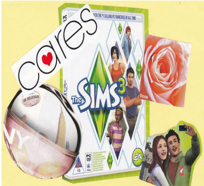
Figure A: Danika