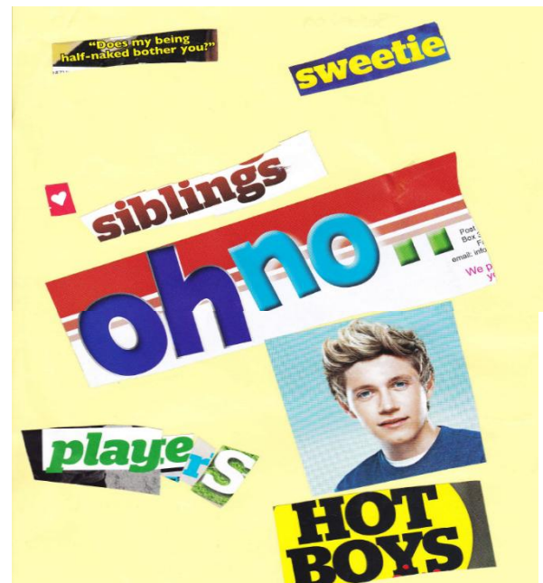
Figure F: Jennifer

Jessica refers to the image of Barbie, a controversial doll, as an ideal female adolescents should strive towards, what they “[are] supposed to look like.” Barbie, a popular toy for young girls, has been criticised as setting unrealistic expectations for girls and confirming sexist ideals. Barbie is a highly sexualised toy, due to her prominent anatomical features such as breasts that are portrayed as desirable. These images contribute to females’ discontent with their own bodies in comparison. In her collage she uses a modern version of Barbie – Bratz – which mimic barbie, and in some instances even accentuate features even more. Young girls, especially, play with