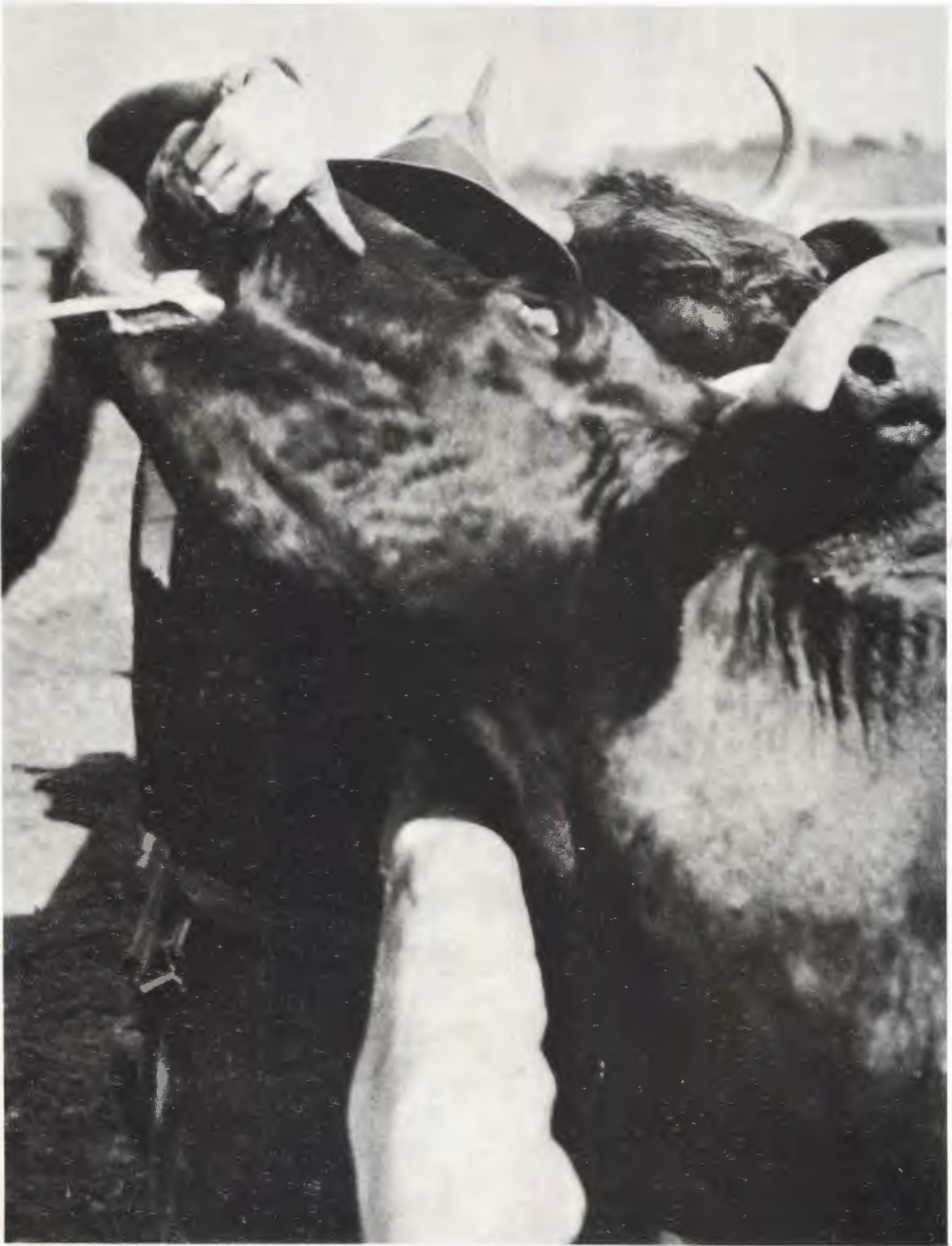
The climactic moment when, with a farmhand holding its tongue, the beast receives its allotted dose on a long-handled spoon.