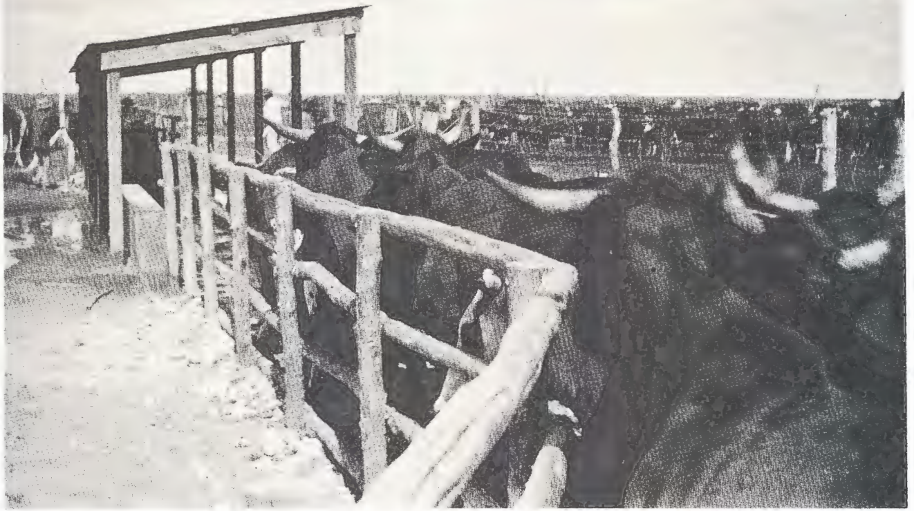
Routine work at Armoedsvlakte – cattle approaching a prophylactic dip to guard against insect pests.