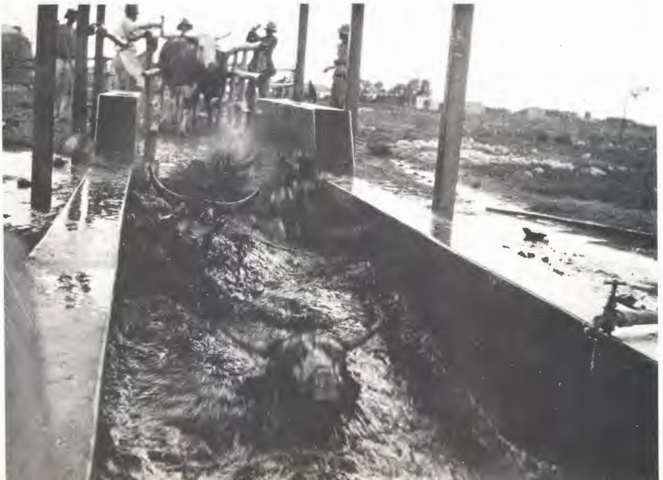
Taking the plunge at Armoedsvlakte.