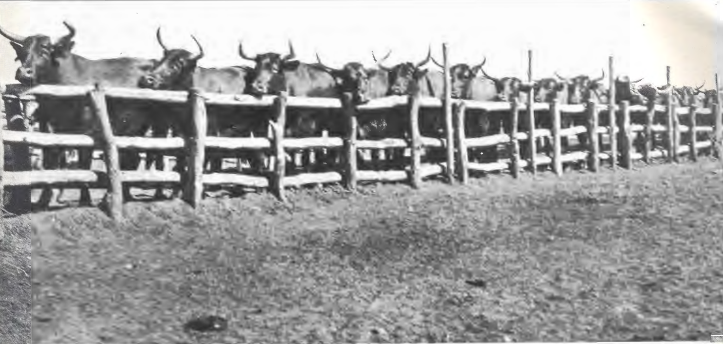
The cattle queue with each animal voluntarily positioned with its head turned toward the point where it will be given a spoonful of bonemeal.