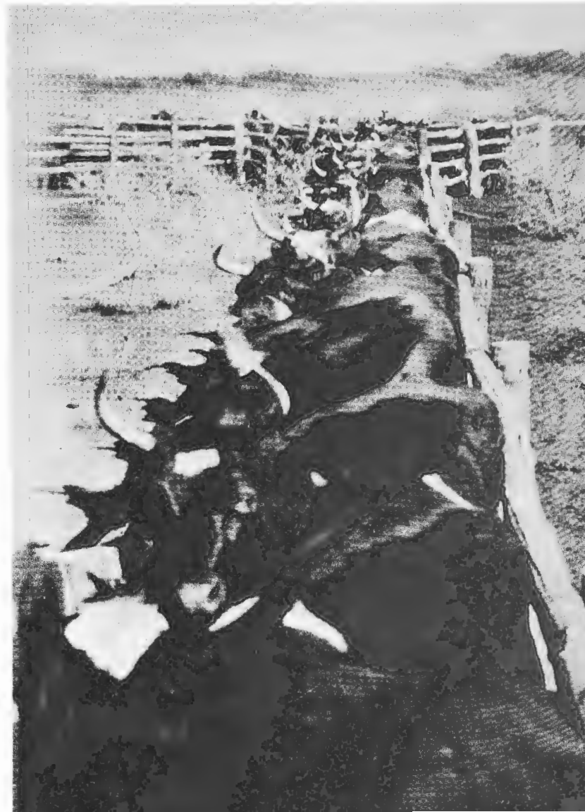
Bonemeal Administration – cattle at Armoedsvlakte willingly entering a crush and queuing for dosage with their heads already turned to the right in anticipation of the desirable morsel.