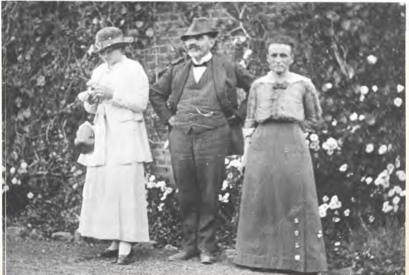
At Home – Sir Arnold and Lady Theiler with a guest in the garden of their house at Onderstepoort.