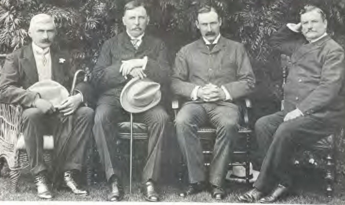
The Colonial Governors – (left): Sir Hamilton Goold Adams – Orange River Colony; Sir Walter Hely-Hutchinson – Cape Colony; Lord Selborne – Transvaal Colony and High Commissioner for South Africa; and Sir Henry McCallum – Natal Colony.