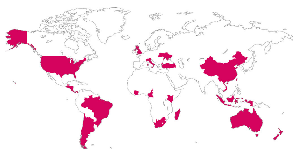
Figure 1. Countries participating in the Global Influenza B Study. April 2014.

The proportion of influenza cases due to type B virus was <20% for 90 seasons, 20–50% for 82 seasons and ≥50% for 28 seasons; the median percentage was 22·6% (IQR 8·3–37·7%). Figure 2 shows the distribution of seasons according to the proportion of influenza cases caused by type B virus, separately for countries situated in the Northern or Southern Hemisphere or in the intertropical belt. The median proportion of influenza B over all influenza seasons was 17·8% in the Southern Hemisphere (IQR 3·5–30·4%; 39 seasons), 24·3% in the intertropical belt (IQR 10·2–40·8%; 94 seasons), and 21·4% in the Northern Hemisphere (IQR 7·3–38·0%; 67 seasons). The P-value for the comparison of the median proportion of influenza B in the Southern Hemisphere versus the intertropical belt was borderline significant (0·07) and not significant for the other comparisons.