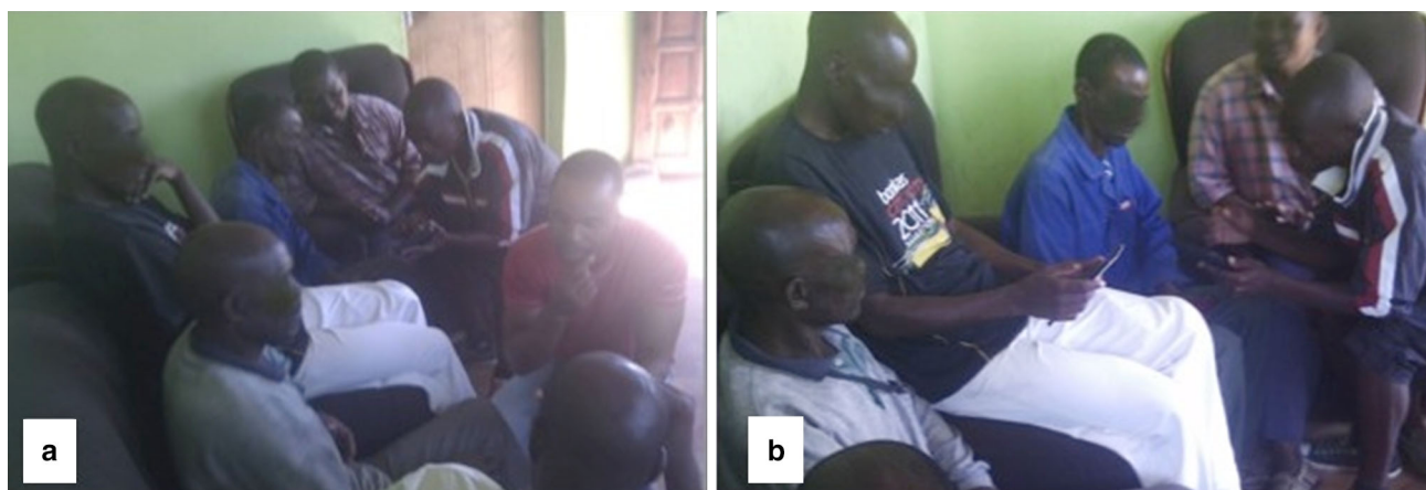
Fig. 3 LR teach Tribal Authority members to use Audio Repository in two groups inside the Headman’s office (colour figure online)