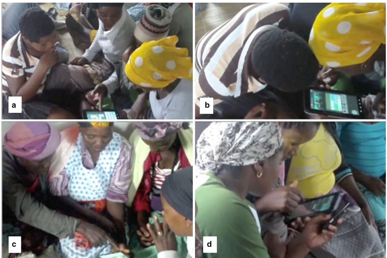
Fig. 2 In workshops to introduce Audio Repository, women (including an LR) guide each other to login to an account (a); replay a recording (b); record audio (c); and share a file across bluetooth to a phone (d) (colour figure online)

by slowly moving the cassette icon of their recording upwards to other single users or downwards to 'public' or 'groups' (c) (colour figure online)