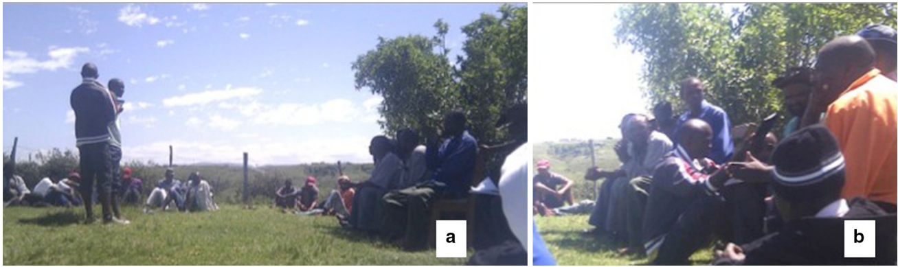
Fig. 4 In meetings the Tribal Authority appointed a young man to carry the tablet between speakers. Here an LR was appointed to carry the tablet between some young community members who were asked

to explain a situation to the Tribal Authority (a) who then responded to the issue of concern (b) (colour figure online)