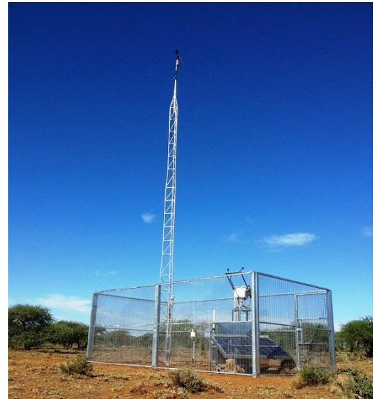
Figure 1a Pyrheliometer and tracker type station

There are two main options in terms of DNI field instruments: a pyrheliometer mounted on a tracker (Figure 1a) and a rotating shadowband irradiator (RSI) (Figure 1b).