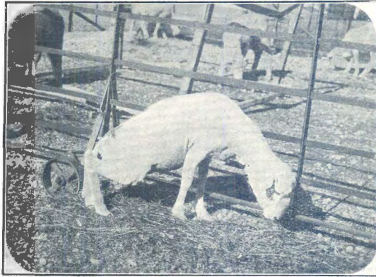
Fig. 2. Acute photosensitisation after dosing H. ethiopicum .

touched the animal showed marked flinching. The appetite and general health otherwise was good. By the end of a month large flakes of dried skin and wool could be removed from the back (see fig. 3). The temperature curve became normal from the 5th day onwards. Blood from the jugular vein was collected daily up to the 18th day, and after centrifuging, the serum was examined for bile pigments. At no time could these be demonstrated, the serum remaining practically water clear, neither were any clinical signs of icterus visible.