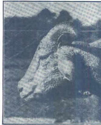
Fig. 5. Swelling of face and ears after dosing H. leucoptychodes .

Another sheep dosed 150 gm. daily for 5 days suddenly died during the night of the 5th day without having shown any symptoms. On post-mortem the fore-stomachs were found to be markedly distended.