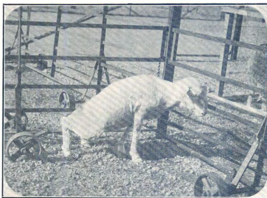
Fig. 1. Acute photosensitisation after dosing H. ethiopicum .

One sheep dosed with 20 gm. in 3 litres water daily for two consecutive days, suddenly died after the second dose with symptoms of hurried respiration and ingesta running from the mouth. Post-mortem examination revealed generalised cyanosis and pulmonary oedema. In this case the dose had obviously been too bulky, so causing asphyxia.