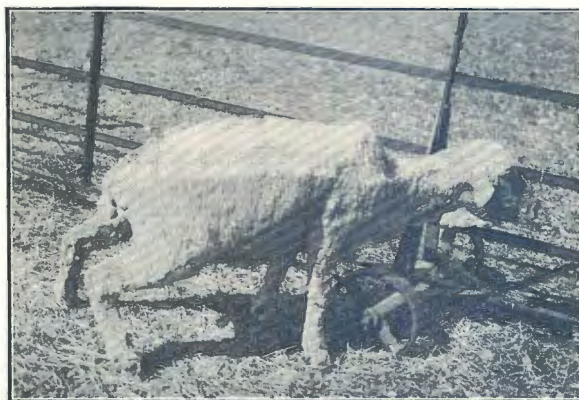
Fig. 2. Acute photosensitisation following injection of Erythrosin.

One gram of erythrosin in saline injected intravenously into a sheep, caused marked sensitisation and scratching of the ears within 3 minutes after being placed out in the sun (see fig. 2). The animal was then returned to the stable. This caused a rapid disappearance of the symptoms. A subsequent injection of a further 0.5 gm. erythrosin again provoked intense sensitisation accompanied by oedematous swellings of the head, ears and also of the skin round the