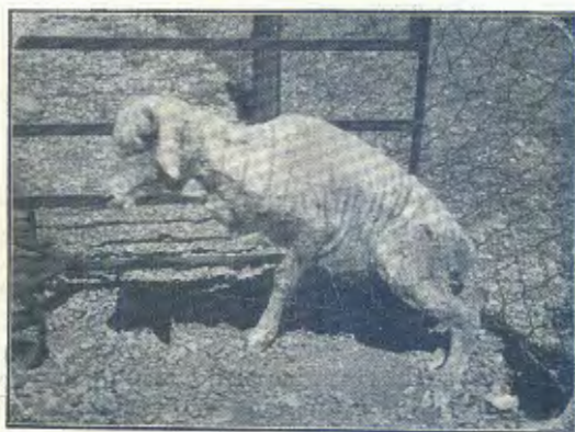
Fig. 1. Acute photosensitisation following injection of Eosin.

One gram eosin was dissolved in 20 c.c. saline and injected intrajugularly into a sheep. Within a few seconds all visible mucous membranes and also the exposed skin assumed an intense pink-red colour. Ten minutes after the injection the sheep became extremely restless in the sunlight. There was marked flinching of the body, shaking and scratching of the head and ears. Due to the severity of the attack of photosensitisation the animal was placed in the stable half an hour afterwards. The symptoms now soon passed off, and within 3 hours after injection the sheep was feeding quietly. The urine was of an intense red colour throughout the day due to elimination of the eosin. The next day the animal was again placed out in the sun. Photosensitisation was very slight, and the ears were slightly swollen. The blood serum now was quite clear and colourless. Subsequently two injections of 0.5 gm. eosin daily, produced only