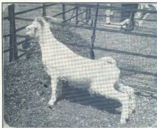
Fig. 5. Acute photosensitisation following injection of Thionine.

One Angora goat was injected 1 gm. thionine intravenously. The animal became acutely photosensitive within a few minutes (see fig. 5). There was marked flinching and scratching until the goat was placed in the stable, when the symptoms soon passed off. Subsequent injections again produced sensitisation. The elimination of the dye, however, was very rapid as noticed from the clearing of the serum, and the transitory nature of the symptoms. Slight haemolysis was noticed on one occasion, although blood was drawn and centrifuged