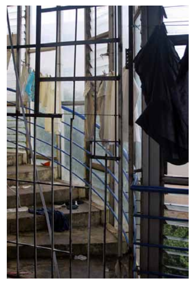
Figure 14 Roodepoort Bank, December 2010.

Even though the Volkskas building is no longer in pristine condition, and may not be valued as an architectural masterpiece by its inhabitants, what is noteworthy is how it has lent itself to being adapted to present circumstances. Although its materials may not have been maintained in the way that the architect envisaged, the design has endured, lending itself to adaptations that bear testimony to the changing needs of its users. Despite the renovations that have taken place, some of the building's original use and function are still evident. The columns in the banking hall permeate the space of the general dealer, a walk-in safe is used to secure valuables, and above all, its modernist aesthetic is a marker of time. In contemporary photographs the opportunity exists to depict an expanded temporal field. The building's past is still clearly visible in the present not as a time capsule, but rather as duration. The photograph is not timeless, but rather 'timefilled'<sup>13</sup>.