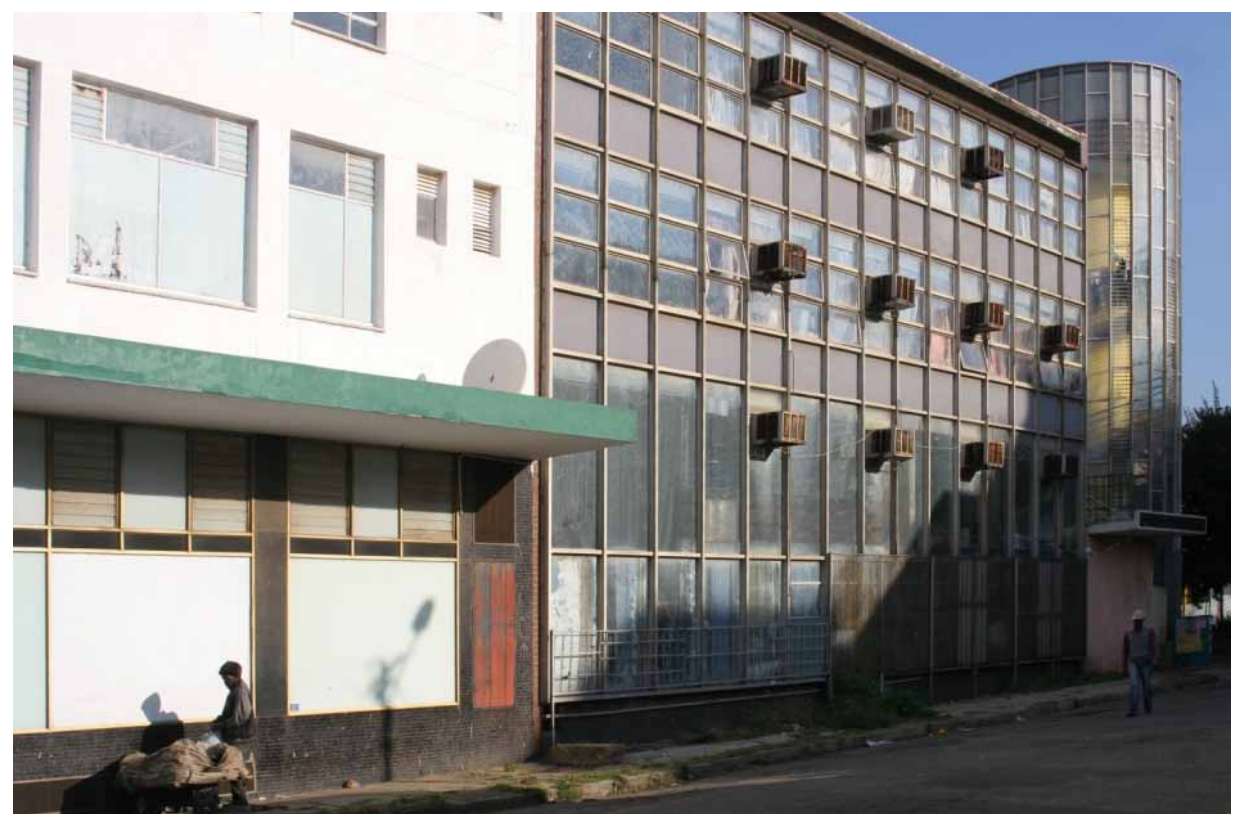
Figure 12 Roodepoort Bank, North Façade, 2011.