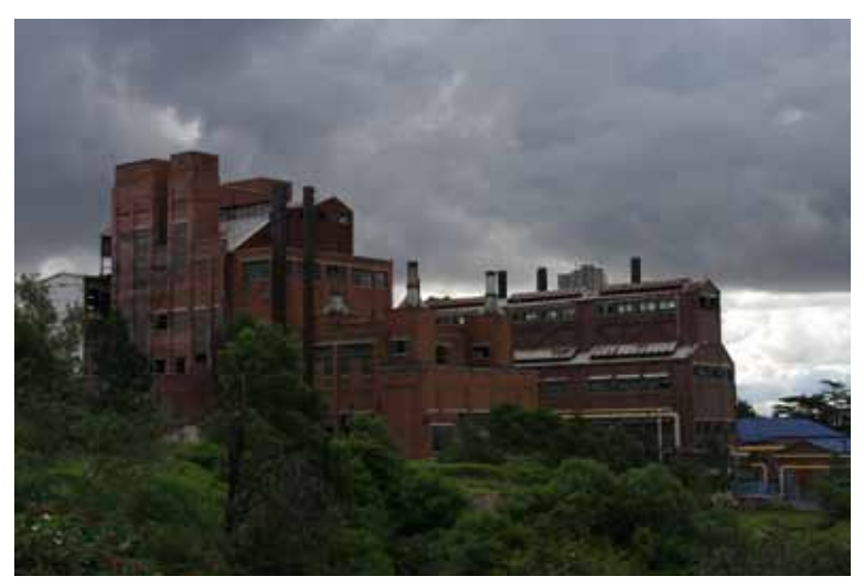
Figure 2 Gas Works 2011.