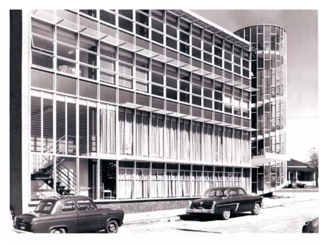
Figure 11 Roodepoort Branch, Reproduced with kind permission of Absa Bank archives.