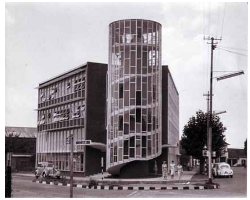
Figure 8 Roodepoort Branch, courtesy of Absa Bank Archives.

whole pieces of the city and whose function now is no longer the original one. When one visits a monument of this type...one is struck by multiplicity of different functions that a building of this type can contain over time and how these functions are completely independent of form" (in Hollis 2010: 9).