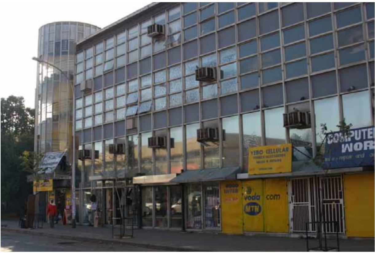
Figure 10 Roodepoort Bank, South Façade, 2011.