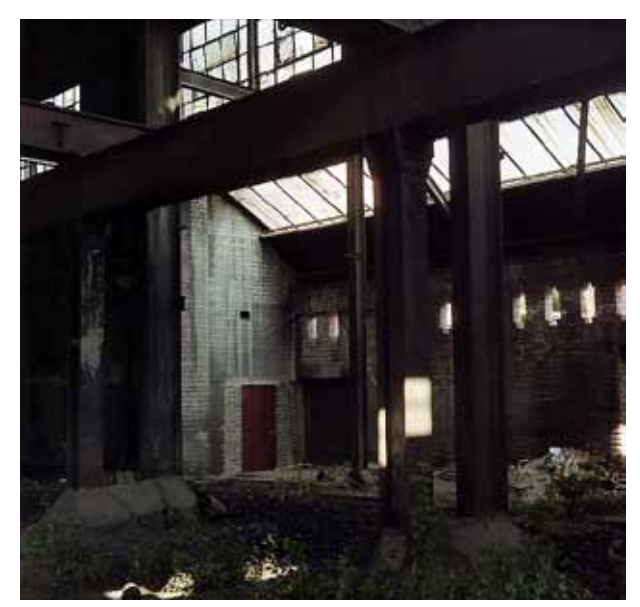
Figure 4 Interior, Gas Works 2011.