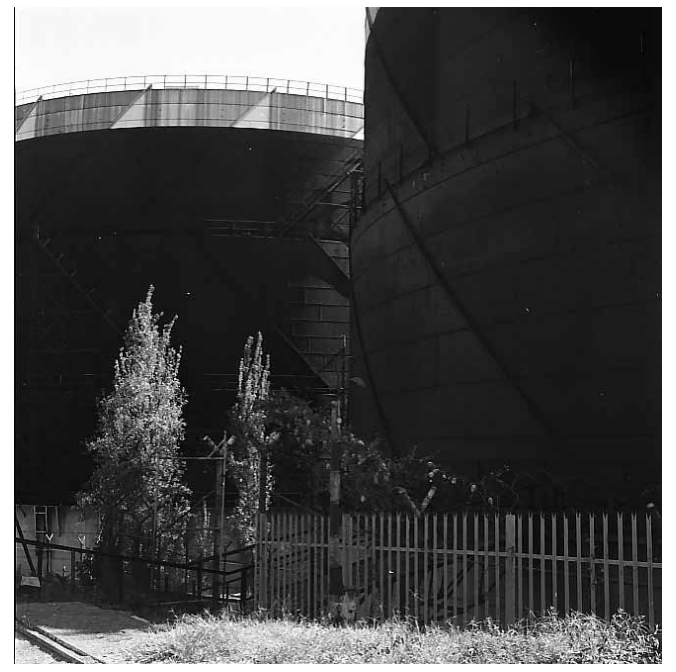
Figure 6 Gas Tanks 2011.

Although mindful of the Becher's pictures of gas tanks, alternatives to their approach had to be sought. The scale of the gas tanks makes them, along with the buildings themselves, a landmark in the area. As JM Richards (1958: 20) remarks, "one of the most important effects aesthetically of the industrial revolution was the introduction into the landscape of structures which had nothing to do with the human scale, but reflected rather, the superhuman nature of the new industrial activities". Consequently, the scale of the structures and the sublime quality of surfaces were a key component of the photography. By placing the camera within relative proximity of the tanks and having it fill the frame, the scale of these structures could be emphasized (see for example, figure 6). In addition, the green and yellow boxes in the foreground of figure 7 are old gas meters, themselves part of a now obsolete technology and economy, whose inclusion in the image was an attempt to make visible this issue. Photography was used, not simply as a tool to illustrate the buildings, but to offer musings on the interplay between architecture and time.