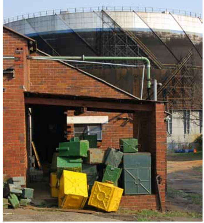
Figure 7 Gas Tank with old gas meters 2011.