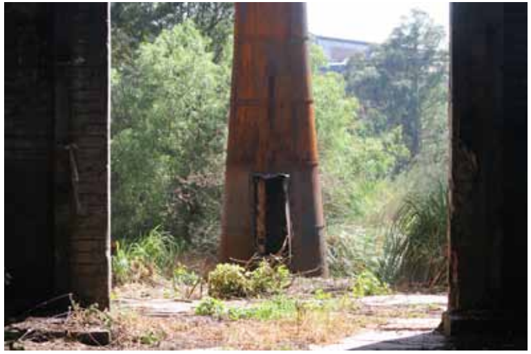
Figure 3 Gasworks Interior, 2011.