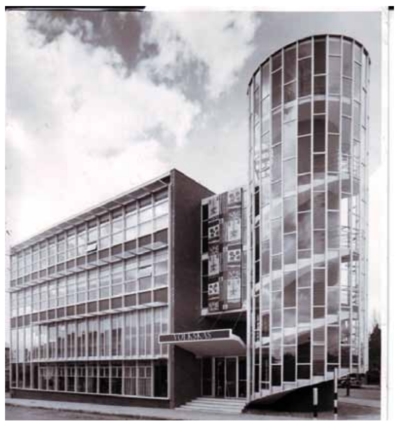
Figure 13 Branch Roodepoort, reproduced with kind permission of Absa Archives.