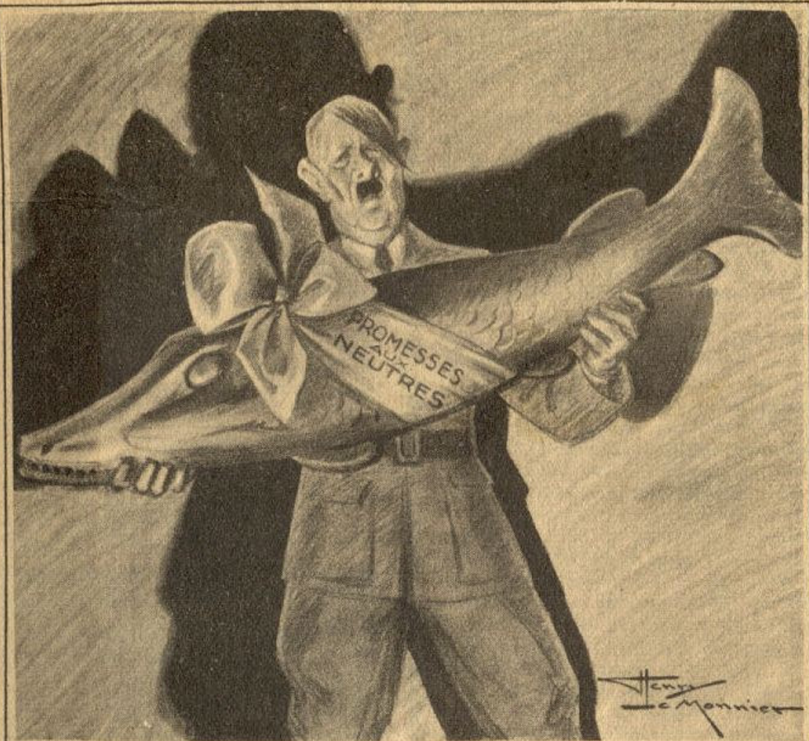
LE POISSON D'AVRIL HITLERIEN