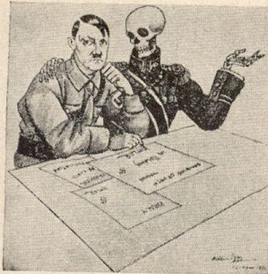
Hitler and Death work in harmony