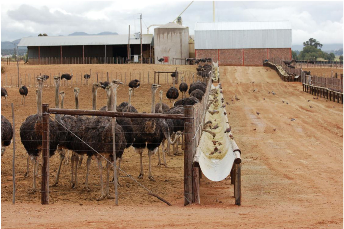
Fig. 3 Ostriches in quarantine, prior to slaughter, on a farm near Oudtshoorn, South Africa. The feeding trays are shared with a high abundance of potential bridge species, including not only doves, pigeons, and sparrows, but also bishop and weaver birds that typically nest in reedbeds or trees that overhang the water.

reporting of potentially infected poultry (Rushton et al. 2005; ASEAN 2010).