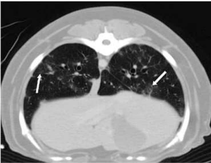
FIG 2: Transverse 2 mm thick thoracic computed tomography post contrast images in a lung windows (Window width, 1400; Window level, -400) of Case 1, an 11-year-old female spayed Cocker spaniel that presented with persistent pyrexia and coughing. Slice just caudal to the heart (A) and 4 cm further caudally (B). There are multifocal areas of ground glass opacities as well as areas of hyperattenuating poorly defined nodular opacities up to 7 mm in diameter throughout the lungs but more so subpleurally and peribronchially. These areas took up contrast increasing the HU by about 20-30 units indicating the areas to be vascularized. Mild bronchial wall thickening and parenchymal bands are seen.