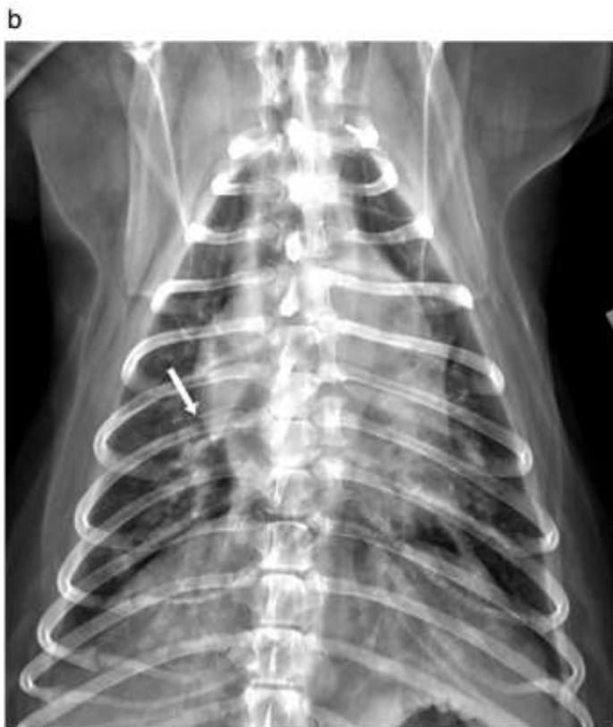
FIG 1: Right lateral recumbent (A) and dorsoventral (B) thoracic radiographs of Case 1, an 11-year-old female spayed Cocker spaniel that presented with persistent pyrexia and coughing. There is a patchy interstitial lung pattern throughout the lungs with some associated nodular consolidation (black arrow). Pleural thickening as evidenced by feint fissure lines are seen at some lung edges (white arrow).