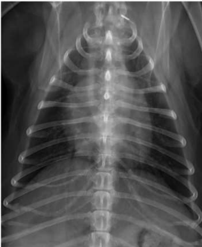
FIG 3: Right lateral recumbent (A) and dorsoventral (B) follow-up thoracic radiographs made 2 months later of Case 1. The lung changes described in Figure 1 have resolved completely.