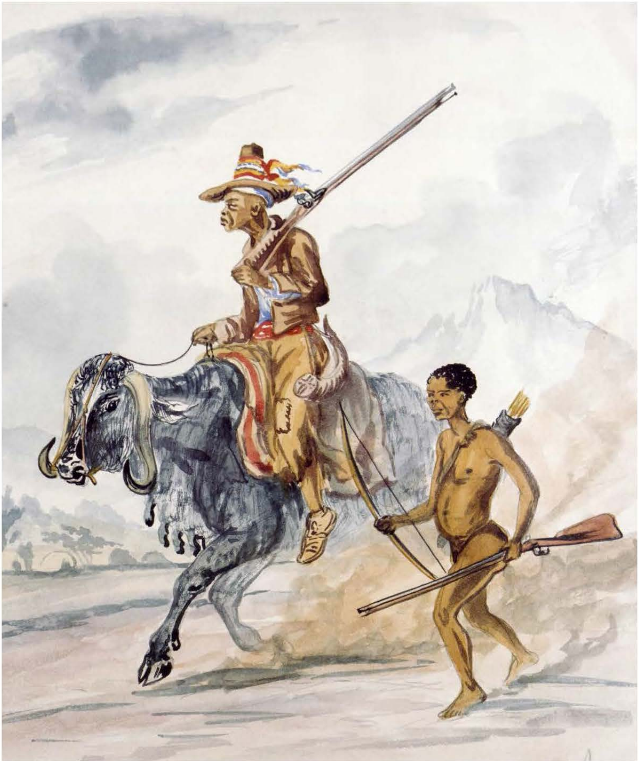
A Khoer hunter with his San “handlanger”/servant. By Thomas Baines.