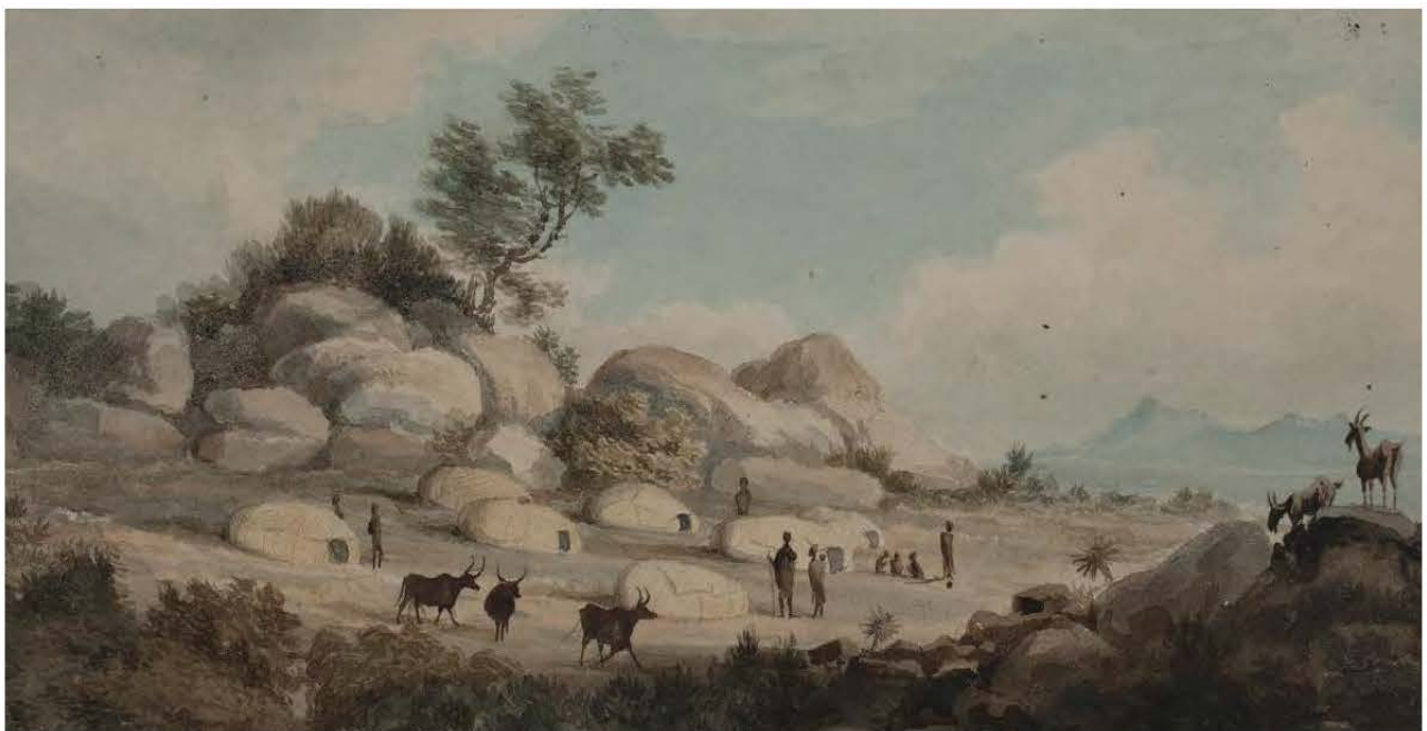
A Korana kraal in Transgariep, on the banks of the Modder River. By Charles Davidson Bell.