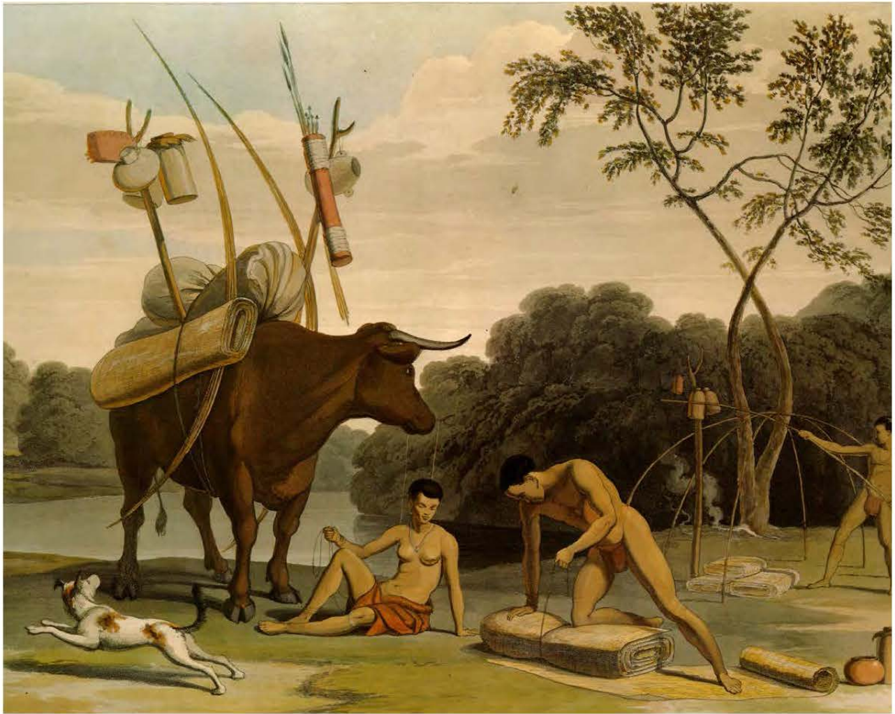
Korana preparing to move camp. By Samuel Daniell.