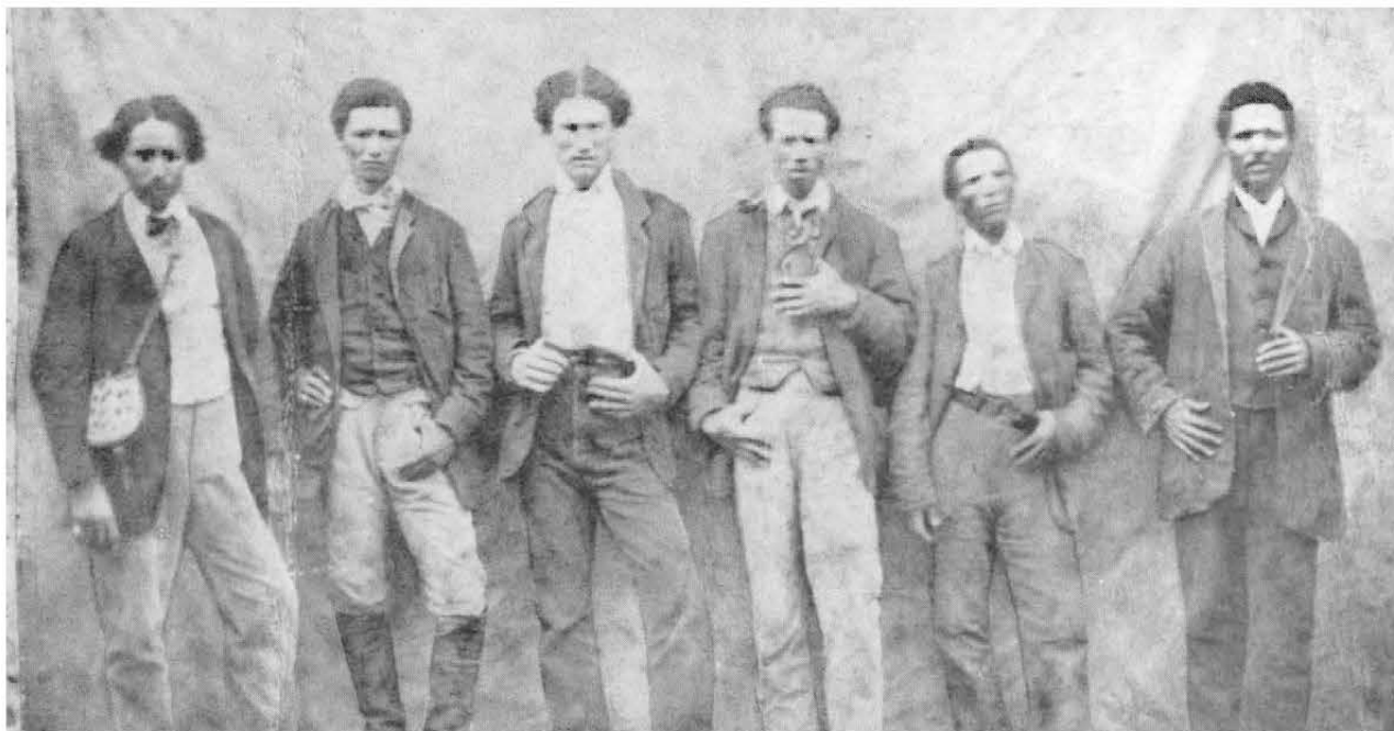
Griqua leaders in 1860.

Some of the San at Campbell received agricultural produce from the Griquas, probably in return for the men's herding their livestock and the women's guarding the fields. Campbell, for example, mentioned that one of the Griquas, who had many San living near him, supported these families with daily rations of "corn". Other San began to acquire and breed cattle, and some even planted crops. With time, quite a number of San was incorporated into the Griquas and intermarried with them.