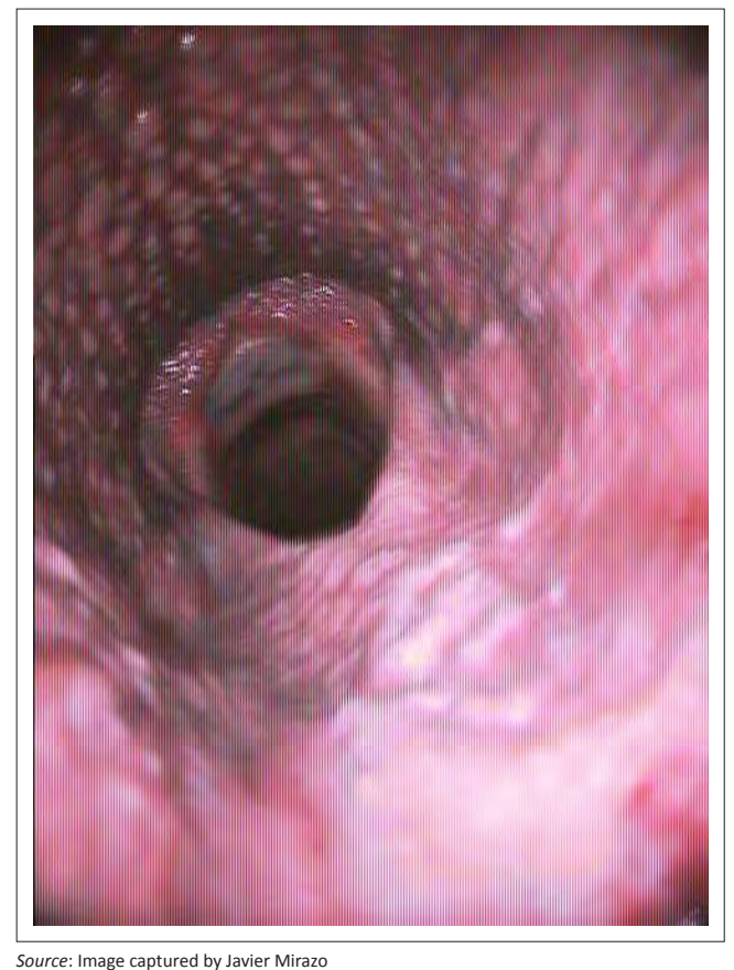
FIGURE 7: Single abnormality observed in the study: Dorsal displacement of the soft palate.

This study was limited to the retrospective evaluation of 52 horses and therefore only reflects a sample of Thoroughbred racehorses with poor performance and/or respiratory noise. Horses presented for DOE may be more valuable horses, or horses with more severe diseases, and therefore this sample may not reflect the Thoroughbred racehorse population in South Africa as a whole. Whilst the mean maximal speed reported in the present study (58 km/h) is similar to the 56 km/h reported for 140 Thoroughbred racehorses undergoing DOE and is similar to the average racing speed of 58 km/h for the winning horse in flat races up to 1.6 km (1 mile) (Allen & Franklin 2010), horses that ran short distances or attained lower speeds during DOE may not have developed any detectable conditions or the actual performance-limiting condition that may have occurred during actual training or racing.