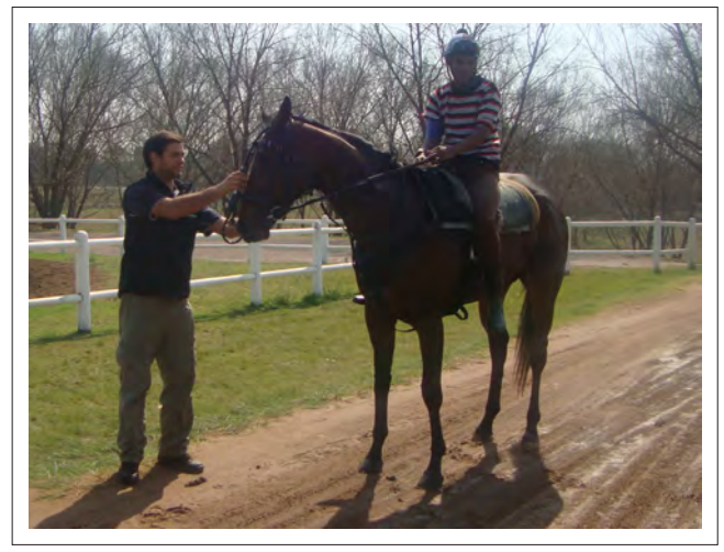
FIGURE 1: Placement of the endoscope at the racetrack.

The primary complaints for horses presented for DOE were abnormal respiratory noise at exercise only (34 of 52 horses, 66%), poor performance only (9 of 52 horses, 17%) and a combination of abnormal respiratory noise and poor performance (9 of 52 horses, 17%) (Table 1).