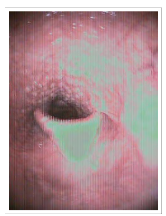
FIGURE 8: Single abnormality observed in the study: Nasopharyngeal collapse.