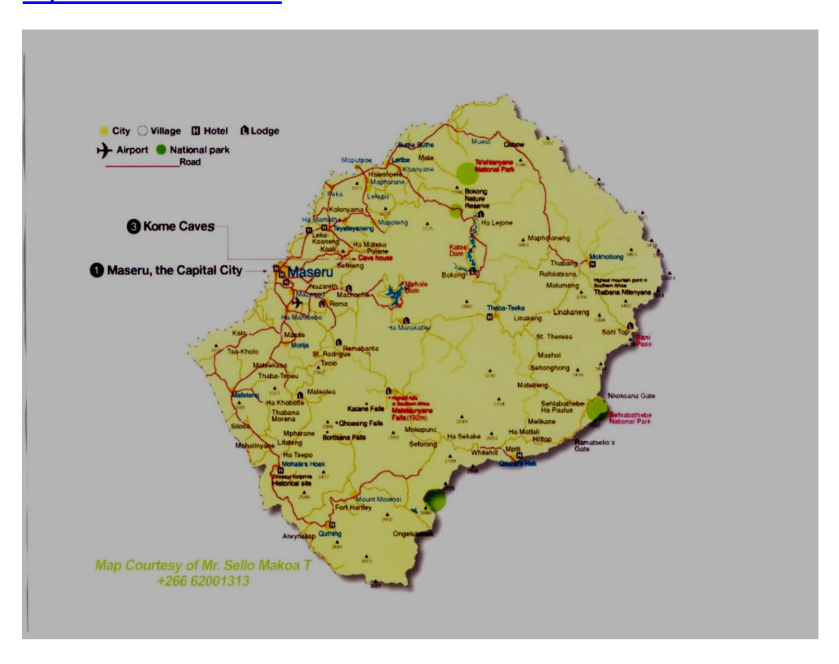
Figure 1.1: A Map showing the location of Ha Kome village and the caves <a href="http://www.komecaves.co.ls">http://www.komecaves.co.ls</a>

The Sefikeng and Sefikaneng mountains tower over Ha Kome on the west. Ha Kome village comprises members of the Kome and Khutšoane families, both originating from the caves. They started setting up settlements away from the caves when they increased in number. The Basia established a village at the top of the Cave Village under the headship of the descendants of Teleka Kome, while the Bataung settled in the gorge not very far from the caves.