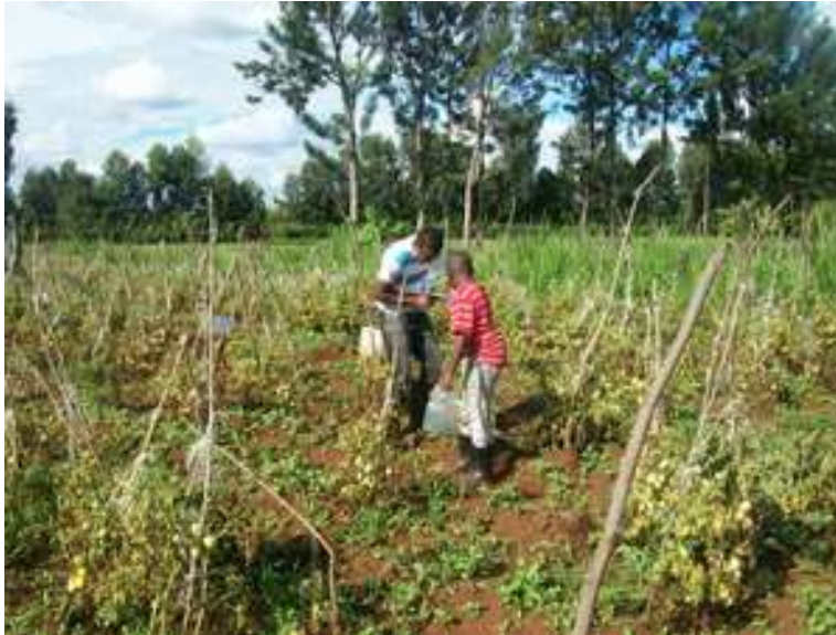
Figure 2. Damage caused by Meloidogyne spp. in a tomato field in Mwea, Kenya.

Based on the level of nematode populations, Meloidogyne spp. can cause high levels of crop loss during growth, increase the cost of production through increased fertilizer application and control programmes, and also significantly reduce post-harvest yields (Figure 2). Crop losses of 30% or more