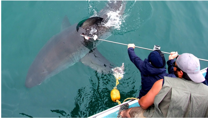
Fig. S1. Sharks were tagged externally while free-swimming with the use of a pole spear after being attracted with bait and chum.