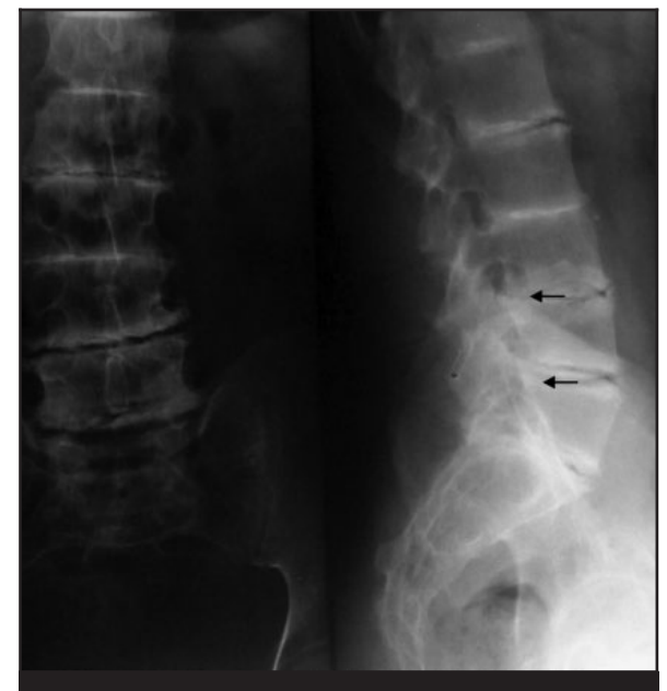
Figure 2. Calcification of the inter-vertebral discs (see arrows)

Ochronosis is a very rare autosomal-recessive disorder of metabolism. It results from a deficiency of the enzyme HGA oxidise, which is involved in the degradation of tyrosine. This results in accumulation of HGA and its degradation products in the tissues. It occurs worldwide but the prevalence is lower than 1:250 000 in most populations.<sup>2</sup>