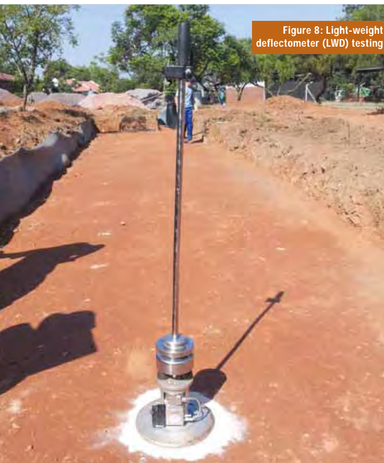
Figure 8: Light-weight deflectometer (LWD) testing