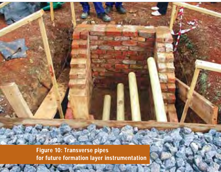
Figure 10: Transverse pipes for future formation layer instrumentation