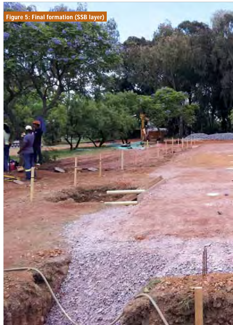
Figure 5: Final formation (SSB layer)