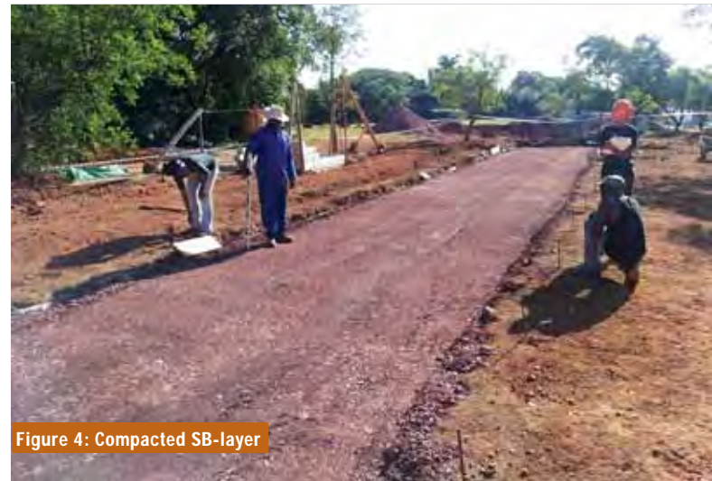
Figure 4: Compacted SB-layer

The subballast layer material (SB-layer and SSB-layer) was a mixture of G5 and G1 material, and these layers were also placed