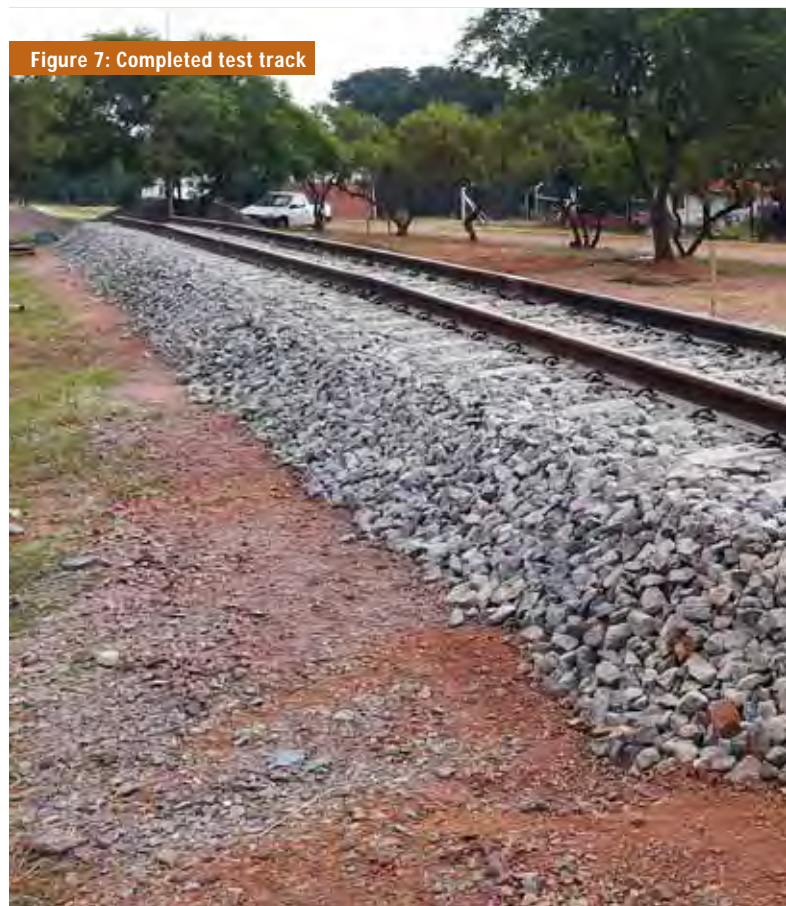
Figure 7: Completed test track