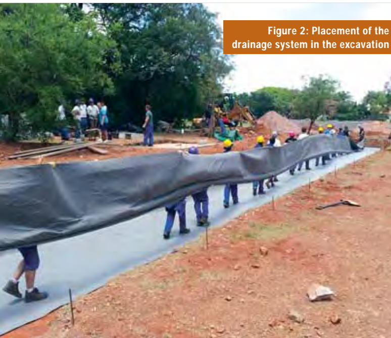
Figure 2: Placement of the drainage system in the excavation