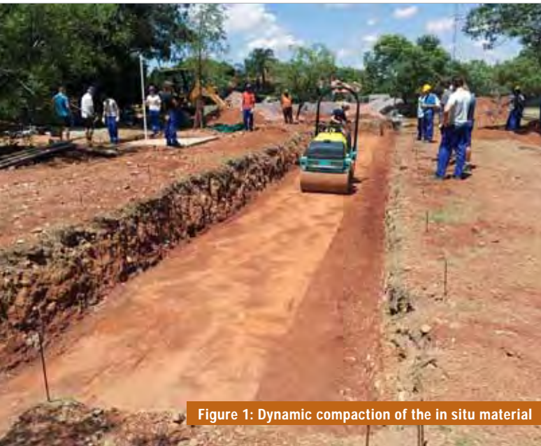
Figure 1: Dynamic compaction of the in situ material