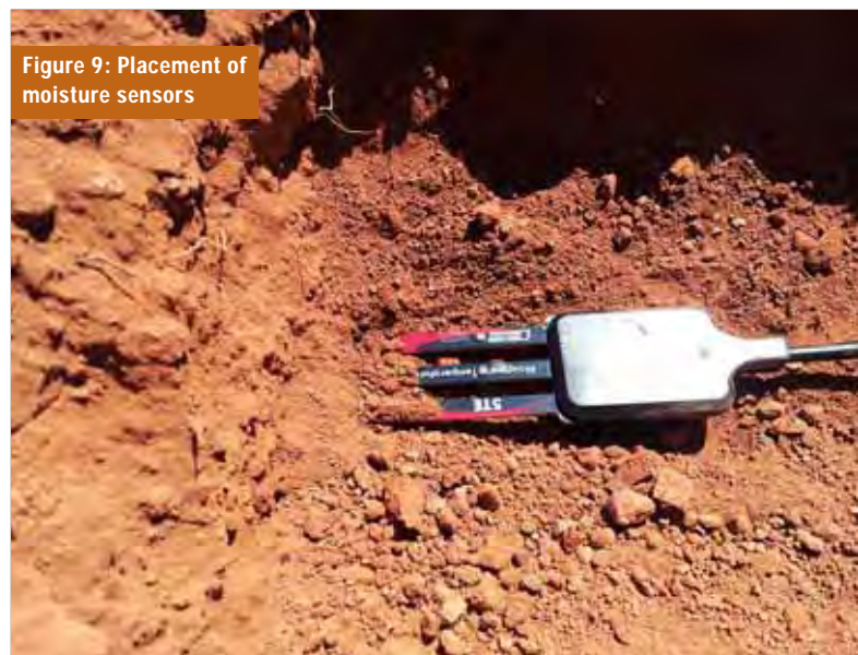
Figure 9: Placement of moisture sensors