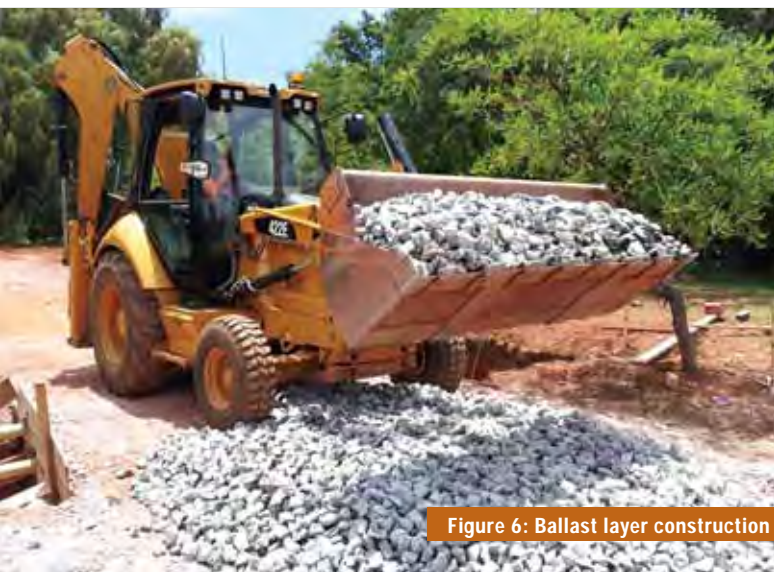
Figure 6: Ballast layer construction

The Chair in Railway Engineering at the University of Pretoria is excited about the opportunities that the new test track facility offers. Students will now have access to a short track section where formation behaviour will be studied and on which newly-developed instrumentation can be tested. The test track has been constructed in such a way that an array of formation and superstructure tests can be carried out to improve understanding of rail track behaviour.