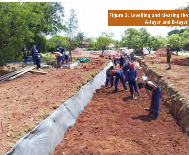
Figure 3: Levelling and clearing the A-layer and B-layer

The layer works were placed after the drainage system had been secured (Figure 3). The subgrade layer material used was sourced from the in situ material excavated at the same site. These layers (A-layer and B-layer) were backfilled in 100 mm increments, whilst removing all large rocks from the layers. The layers were compacted to the correct levels and were continuously monitored by surveying the settlements.