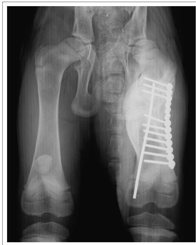
Note: General bone density is within normal limits and there is a marked amount of callus formation associated with the proximal left femur fracture site, which is mature and bridging on the cranial and medial aspect of the fracture line. These radiological findings demonstrate satisfactory healing progress of the femoral fracture.

Both cubs experienced profound bradycardia and hypotension during anaesthesia. Multiple factors could have contributed to these effects. Bradycardia associated with hypertension was expected as a consequence of medetomidine and ketamine administration; on the contrary, the cubs were hypotensive. Thus, the bradycardia experienced in both cubs was unlikely to be due to the peripheral medetomidine effects causing vasoconstriction and hypertension. The peripheral vasoconstriction effects may have dissipated prior to measuring the blood pressure, thus the remaining bradycardia, which caused a decreased cardiac output, may partially explain the hypotension (Tranquilli, Thurmon & Grimm 2007). Centrally mediated effects of medetomidine may partially explain the bradycardia and hypotension, suggesting a relative overdose despite staying within the recommended dose ranges for adult tigers (Curro et al. 2004). Paediatric animals may be more sensitive to the pharmacodynamic effects of medetomidine than adult tigers (Tranquilli et al. 2007). Isoflurane and propofol are both vasodilators that cause a decrease in systemic vascular resistance (Tranquilli et al. 2007), which could have contributed to the hypotension. Morphine may also