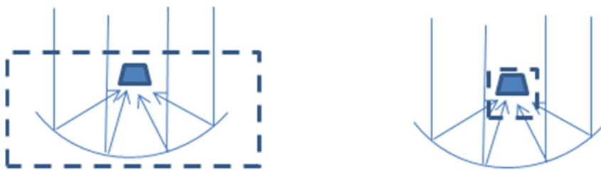
Figure 2. Control volume boundary including or excluding the solar reflector.

The selection of the control volume around the analysed system and the selection of \dot{Q}^* , or the term in front of the bracket in Eqs. (12, 15 – 17), is very important. \dot{Q}^* depends on which boundary is referred to in the analysis. For example, Eqs. (12, 15 - 17) can be used to describe the incoming exergy from the sun or the incoming exergy from a reflector, see Figure 2. \dot{Q}^* can thus be the beam irradiance, in the case where it is coming from a