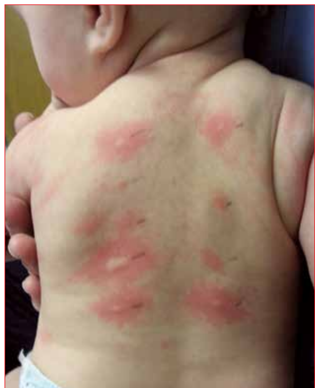
Figure 3: SPT on the back