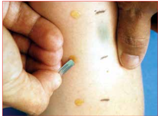
Figure 2: SPT on the forearm

Muscle relaxants and opioids may result in false positive reactions. Therefore, it is important to obtain a complete drug history in the history taking. Falsely diagnosing a patient with allergies can have a major negative impact on the patient and his or her family.