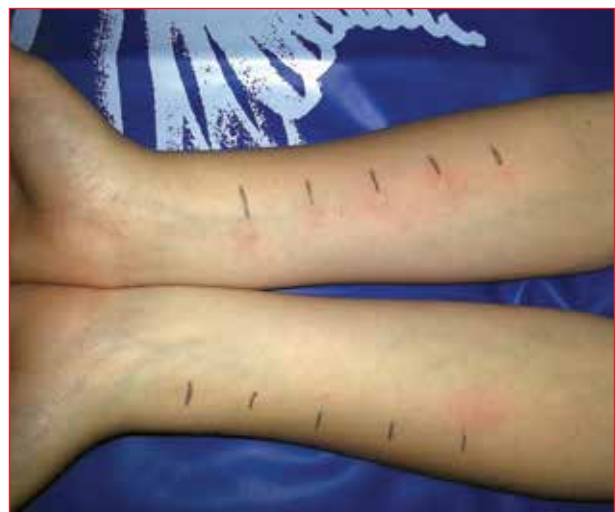
Figure 4: SPT reactions