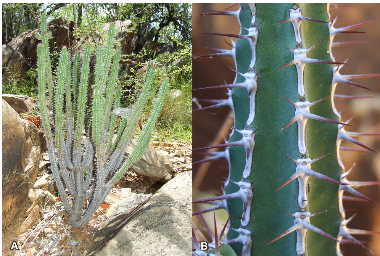
FIGURE 1. Euphorbia otjipembana subsp. okakoraensis : (A) plant in natural habitat, \pm 0.8 m tall; (B) branch indicating spine shields.

Type: —NAMIBIA. Kunene Region: Stony northeastern slopes of Okakora Mountains near Okombambi, 1712BB, 930 m, 24 March 2007, Swanepoel 271 (holotype WIND!; isotype PRE!).