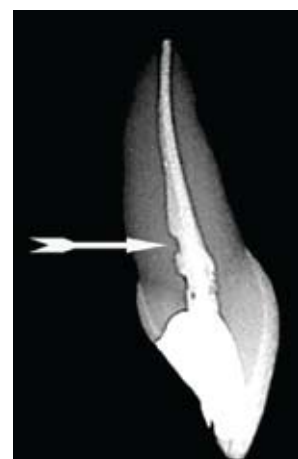
Figure 7: A Thermafil technique specimen (upper central) that illustrates irregularities of less than 1mm (Score 2) in the coronal aspect (arrow) of the root canal. No irregularities were evident in the apical aspect of the root canal (Score 1).