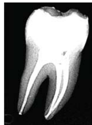
Figure 6: An example of a Thermafil technique specimen (lower first molar) that was well condensed with no areas of radiolucency in the mesial and distal root canals (Score 1).