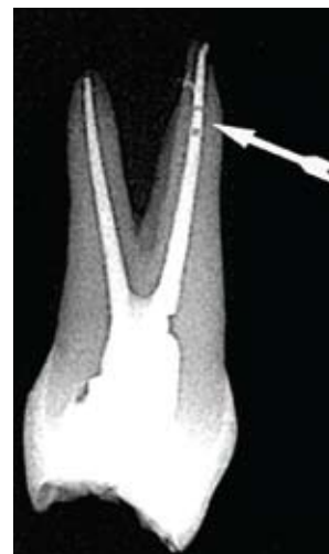
Figure 5: System B/Obtura technique specimen with an imperfect root filling (Score 2) in the apical aspect (arrow) of the buccal canal of a maxillary premolar.

The specimens that were obturated with Thermafil and EndoREZ techniques demonstrated the lowest number of radiographic obturation defects in the apical aspects of the root canals compared with all the other groups. However, there was only a statistically significant difference between the means of the data of these two techniques and that of the Hybrid Root SEAL technique ( p < 0.05 ).