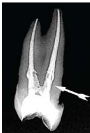
Figure 4: An EndoREZ technique specimen (upper premolar) that illustrates irregularities of less than 1mm (Score 2) in the coronal aspects (arrow) of the buccal and palatal canals. In the apical parts of the canals there were no irregularities and the material was well condensed.

There was evidence of only one imperfect root filling (Score 2) in the coronal aspect of a lower canine (arrow), and one in the apical aspect of a buccal canal of an upper premolar (arrow) (Figure 5), amongst all the other root canals in this group.