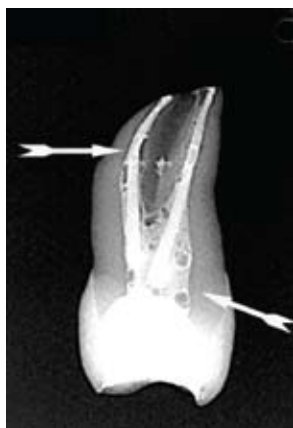
Figure 3: A Hybrid Root SEAL technique specimen (upper premolar) that illustrated irregularities of less than 1mm (Score 2) in the coronal aspect of the buccal canal (arrow right) and the apical aspect (arrow left) of the palatal canal.

Most of the canals in this group demonstrated well-condensed root fillings with no areas of radiolucency (Score 1) in the coronal as well as the apical aspects of the root canals (Figure 1).