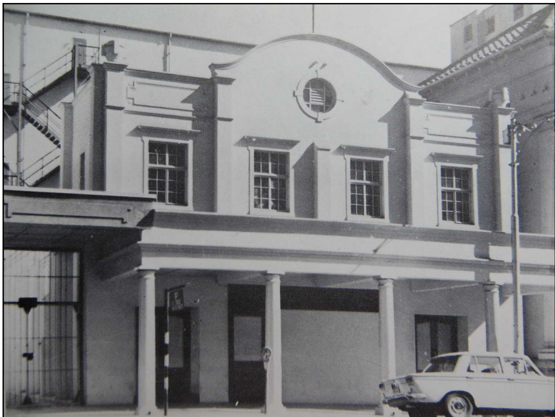
The Baptist Church today [1971]: the bindery of the State Library [All-01, p81]