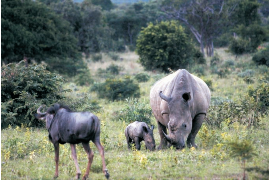
Fig. 1. Southern white rhinoceros female 2 (Fig. 2b) with a four-day-old newborn calf in Lapalala Wilderness, South Africa

reactive progesterone metabolites using an enzyme immunoassay (EIA) for 5\alpha -pregnan- 3\beta -ol-20-one, which has been shown to provide reliable information on reproductive steroid hormone pattern by reflecting total progestagens in different mammalian species (Szdzyu et al. 2006; Ahlers et al. 2012). The EIA used a polyclonal antibody against 5\alpha -pregnan- 3\beta -ol-20-one-3-hemisuccinate-BSA and 5\alpha -pregnan- 3\beta -ol-20-one-3-hemisuccinate-peroxidase label (Szdzyu et al. 2006). Cross-reactivities of the antibody used are described by Szdzyu et al. (2006) and were as follows: 5\alpha -pregnan- 3\alpha -ol-20-one, 650%; 5\alpha -pregnan- 3\beta -ol-20-one, 100%; 4-pregnen-3,20-dione, 72%; 5\alpha -pregnan-3,20-dione, 22%; <0,1% for 5\beta -pregnan- 3\alpha ,20 \alpha -diol, 4-pregnen-20 \alpha -ol-3-one, 5\beta -pregnan- 3\alpha -ol-20-one, 5\alpha -pregnan-20 \alpha -ol-3-one, 5\alpha -pregnan- 3\beta ,20 \alpha -diol and 5\alpha -pregnan- 3\alpha , 20 \alpha -diol. EIAs were performed following Prakash et al. (1987). Sensitivity (90% binding) of the assay was 4 pg/well. Intra- and interassay coefficients of variation, determined by repeated measurements of high and low value quality controls ranged between 9.3% and 16.5%. To adjust for water content variations, FPM concentrations were expressed as mass/dry mass of faecal extract.