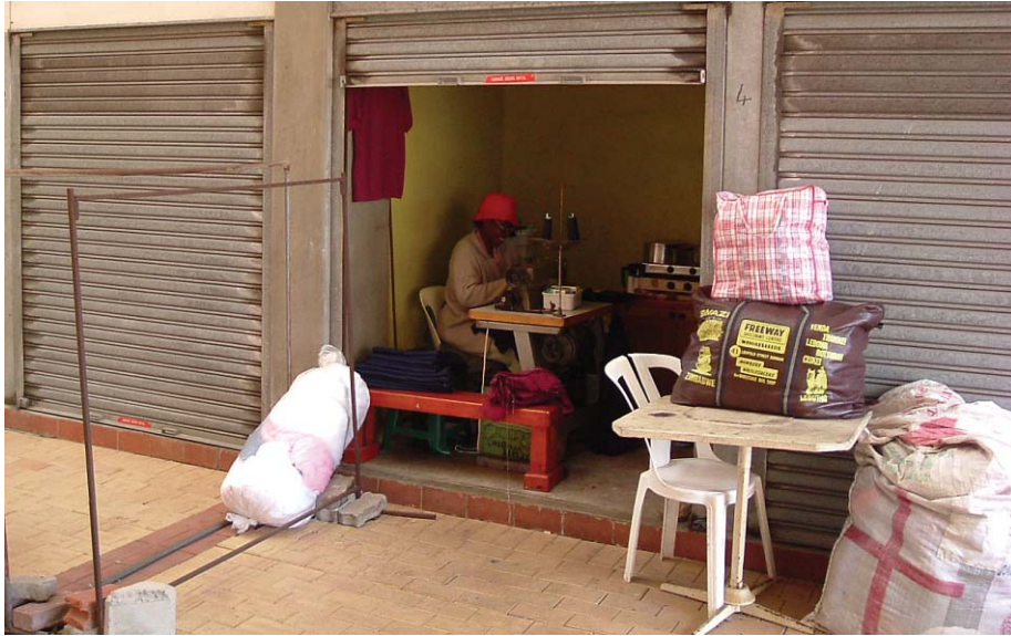
An example of a kiosk within the Strollers Overnight Accommodation and Business Facility

management aspects. The second category addresses issues relating to authority. This aspect deals with the statute of establishment, founding documents or mandates given. Thirdly , the category of compliance deals with how the organisation meets its obligations to third parties, such as spheres of government, landowners, funders. The fourth category assesses the competence of the organisation's incumbents manage the operational aspect the entity. In the fifth category, an assessment is made of how the organisation interacts with a variety of stakeholders. A selection of recommended theoretical perspectives include: