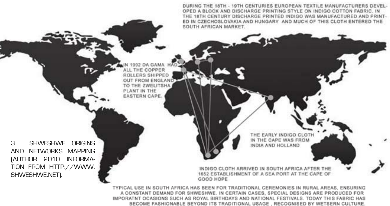
3. SHWESHWE ORIGINS AND NETWORKS MAPPING (AUTHOR 2010 INFORMATION FROM HTTP://WWW.SHWESHWE.NET ).

The intervention aims to strengthen local networks between the initial supplier, manufacturer and end distribution/user within the city. As the primary supplier of material goods, Shweshwe, a local textile design and manufacture company, will be the main stakeholder .Shweshwe has over the decades become part of various African cultures (refer to Fig.3), The clients that plug into the building would be both private sector investors (clothing designers and manufactures), as well as semi-formal entrepreneurs, e.g. in clothing and shoe repair. The aim is to create a symbiotic relationship between larger sector investors, and semi formal entrepreneurs.