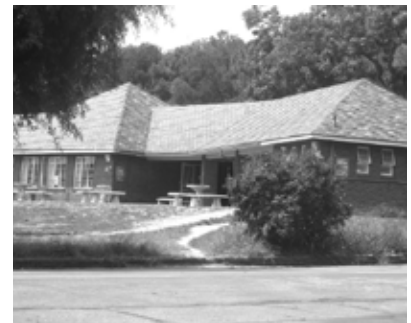
Fig. 4.7: kiosk with inadequate areas for social interaction and too little shade.