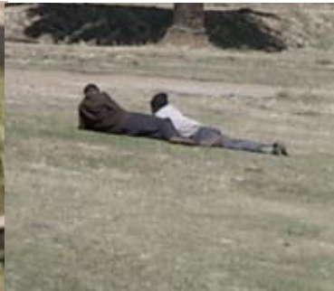
Fig. 4.26: (middle) Weskoppies patients lying on the lawn (Author 2009).