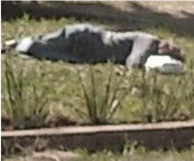
Fig. 4.25: (right) Weskoppies patient sleeping on the lawn