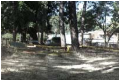
Fig. 4.15 (far right) Tennis courts also used for basketball & netball (Author, 2009).