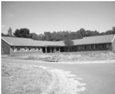
Fig. 4.2: western male wards without outdoor social area

The land use and building functions on the campus includes housing for staff and patients, buildings and other infrastructure that accommodate the treatment of mental illnesses, as well as training for medical students from the University of Pretoria.