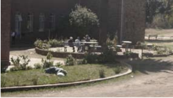
Fig. 4.22: (top far right) patients socializing outside the kiosk (Author 2009)