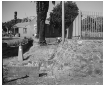
Fig. 4.6: nurses homes enclosed with palisade fencing