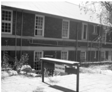
Fig. 4.5: nurses homes with no connection to the outdoors or nature.