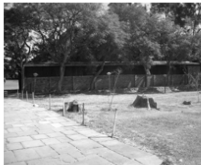
Fig. 4.9: clubhouse