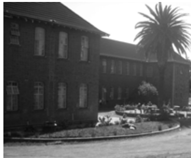
Fig. 4.3: eastern male wards with a small outdoor socializing area.