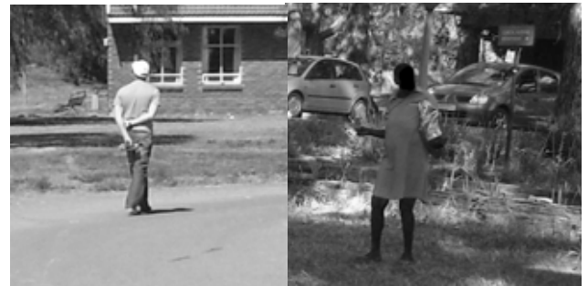
Fig. 4.24: (far right) patient wandering around on informal path

Patients that need supervision are occasionally taken for walks in groups or individually. Patients are often seen wandering around and strolling on their own or in pairs making use of vehicular routes (Fig. 4.23) and informal paths (Fig. 4.23). There exists no pedestrian movement system. Due to the potential variety of the outdoor environments at Weskoppies there is an opportunity to provide Weskoppies with pedestrian routes that exposes the pedestrian to a variety of experiences.