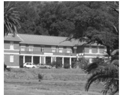
Fig. 4.4: female wards without social outdoor spaces