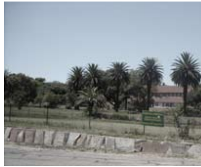
Fig. 4.17: Juksej court doesn't accommodate spectators (Author, 2009).