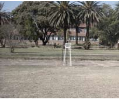
Fig. 4.16: Volleyball court with no shaded places to sit for spectators (Author, 2009).