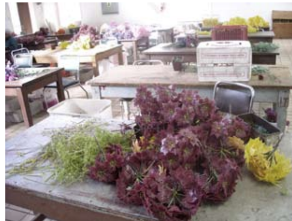
Fig.4.19 & 4.20: photos of the workshop where plastic funeral flowers are being assembled by Weskoppies patients (Author 2009)

Some of the workers in the gardens are older generation patients and very few of the younger people work in the gardens. This becomes a problem because the productivity of the older patients are decreasing. There exists a need to encourage the younger generation of patients to become involved in outdoor work schemes and develop a sense of self worth, ownership and responsibility for their outdoor environment (Mabena, 2009).