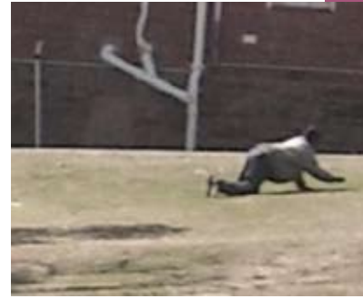
Fig. 4.18: Patient doing physical exercises (Author, 2009).