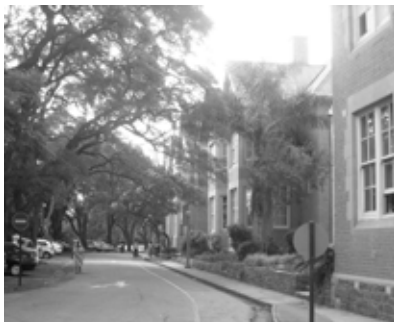
Fig. 4.8: Administration (Heritage building)