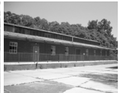
Fig. 4.10: occupational therapy with no connection to the outdoors.