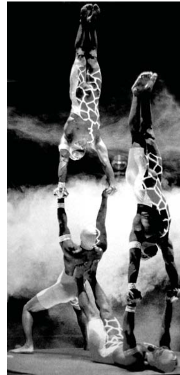
Figure 5.5 South African act from the Boswell Wilkie Circus

With its established name, experience and dedicated owner, the Boswell Wilkie Circus can once again begin to recruit its staff and also source international acts. Being housed in a building within the CBD will help establish the school in the community, not only of the city, but beyond its borders. The circus school will also be able to collaborate with the Tshwane Cultural Centre which employs local craftsmen, such as tailors and bead workers. People can be trained in these crafts and assist in the making of costumes for the performers. With its various clients, Capitol becomes a joint initiative to reintroduce the fantastic and empower people.