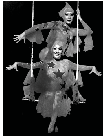
Figure 5.6 Flying Trapeze performers from Beijing Circus performing for Boswell Wilkie Circus