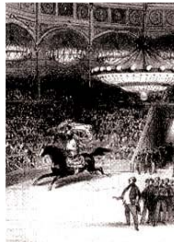
Figure 5.2 The interior of the Cirque d'Hiver during an equestrian performance.

According to Suzie Wilkie (2009), the circus began to decline in the early 1990's as a result of: travelling costs, maintenance costs, payment of international acts, as well as a surge in animal rights, even though the Wilkie Circus insisted that all their animals were part of their circus family and were treated very well. Location also became a problem. With the expansion extending the skin