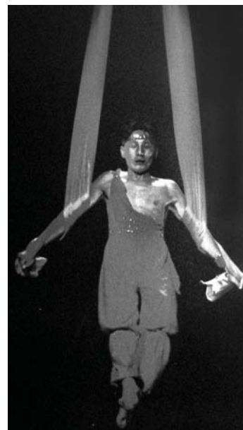
Figure 5.3 Performer from Beijing Circus performing for Boswell Wilkie Circus