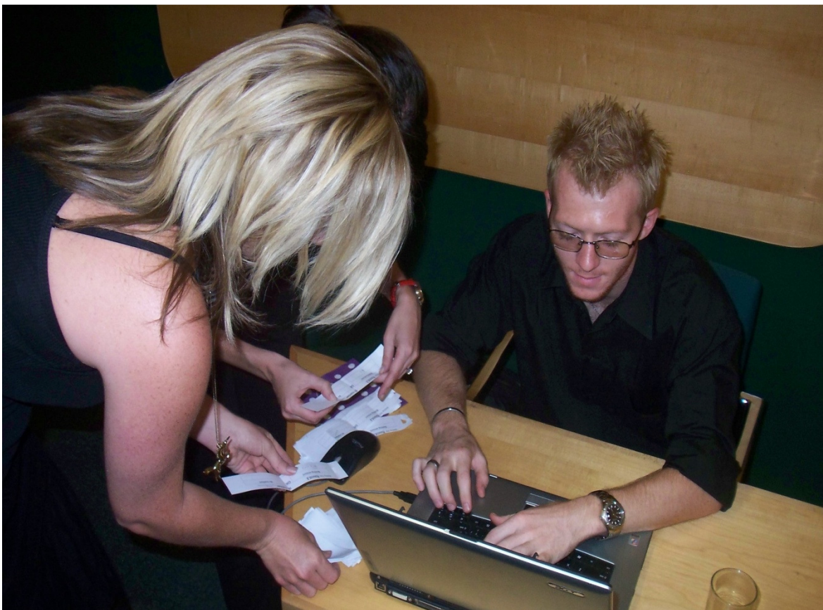
Helpers collecting and sorting auction bids.