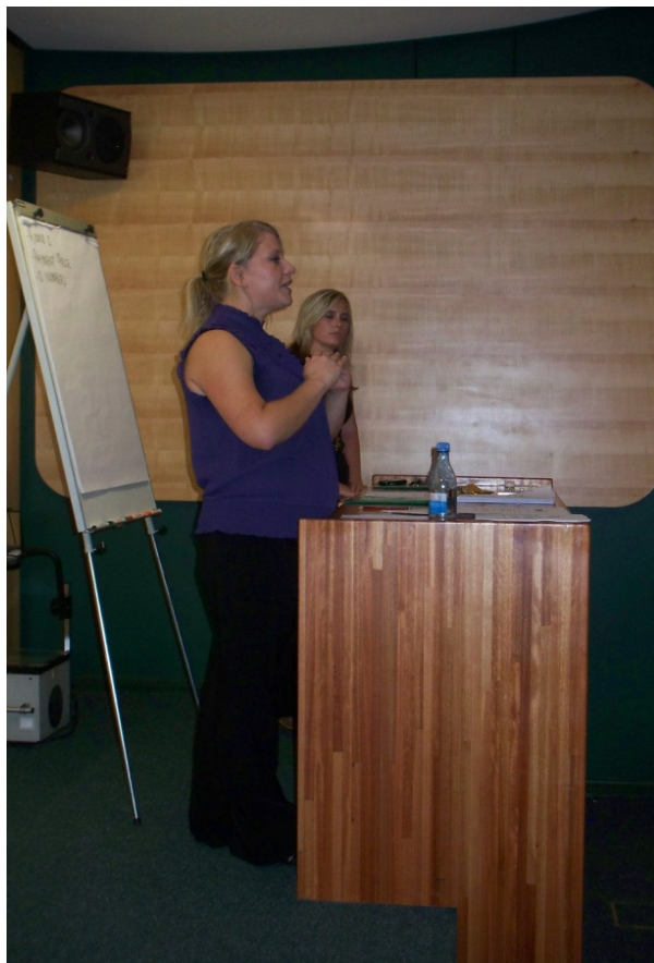
Facilitator explaining the auction instructions to participants.