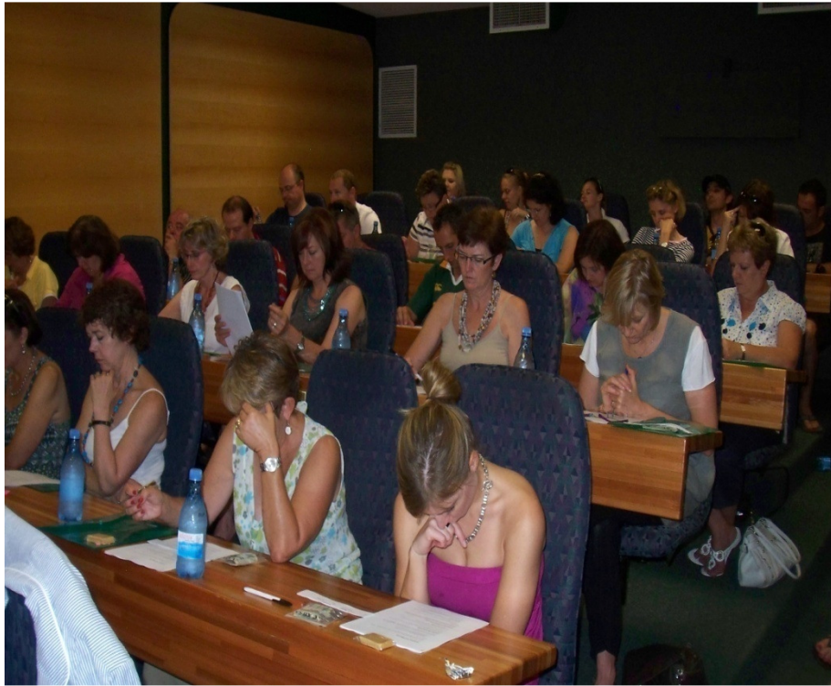
Participants completing pre-auction survey.