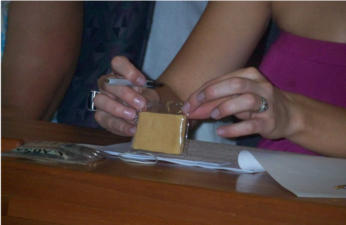
Participant examining fudge from practice auction.