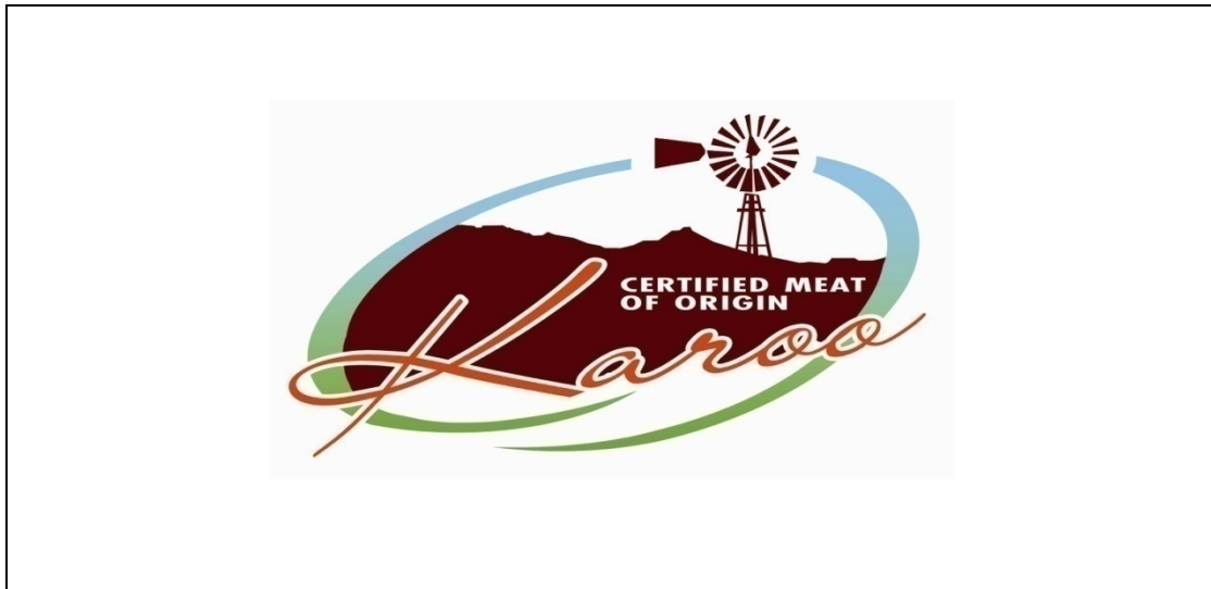
Figure 3.4 Certification mark for Karoo meat of origin

Participants were then asked to place a bid to upgrade the base product to the product certified as Karoo lamb. There was no limit as to what they could bid, i.e. no monetary constraint was placed on bidders. One can argue that there are some monetary constraints, but with the product having a market value of approximately R50 and participants being endowed with R200 as compensation for attending the auction and bidding money, any participant could easily bid four times the market value of the base product as a premium on the base product, however, this would be a highly unlikely scenario. If participants wished to bid more than R200 as the premium, they would have the option to pay the difference from their own pocket (as would be the realistic market situation). No verbal or written constraints on bids were placed during the auction.