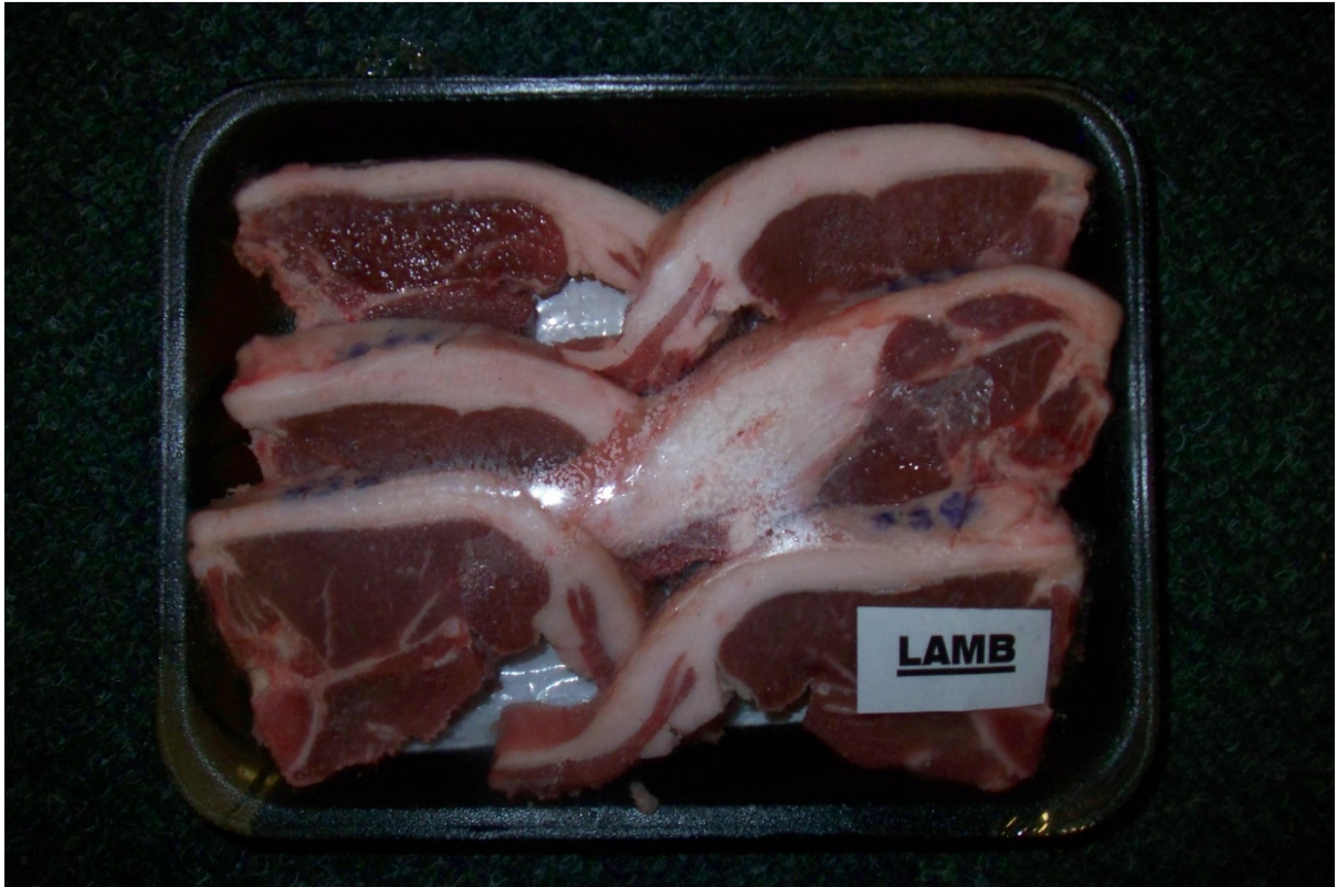
Generic lamb loin chops.

UNIVERSITEIT VAN PRETORIA UNIVERSITY OF PRETORIA YUNIBESITHI YA PRETORIA