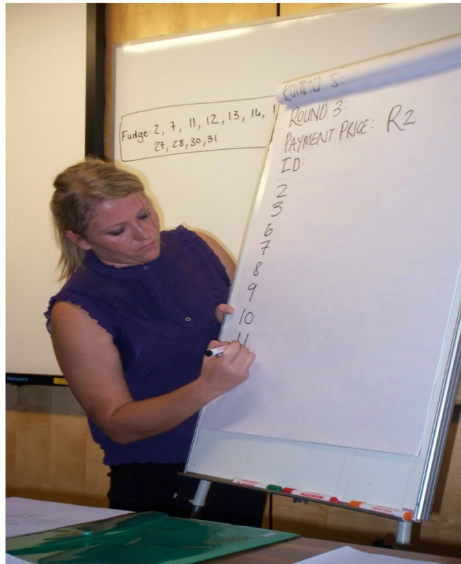
Payment price and bidding round's winners revealed.