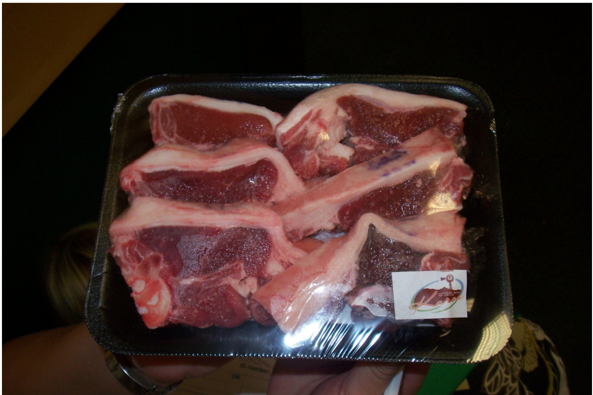
Certified Karoo lamb loin chops.