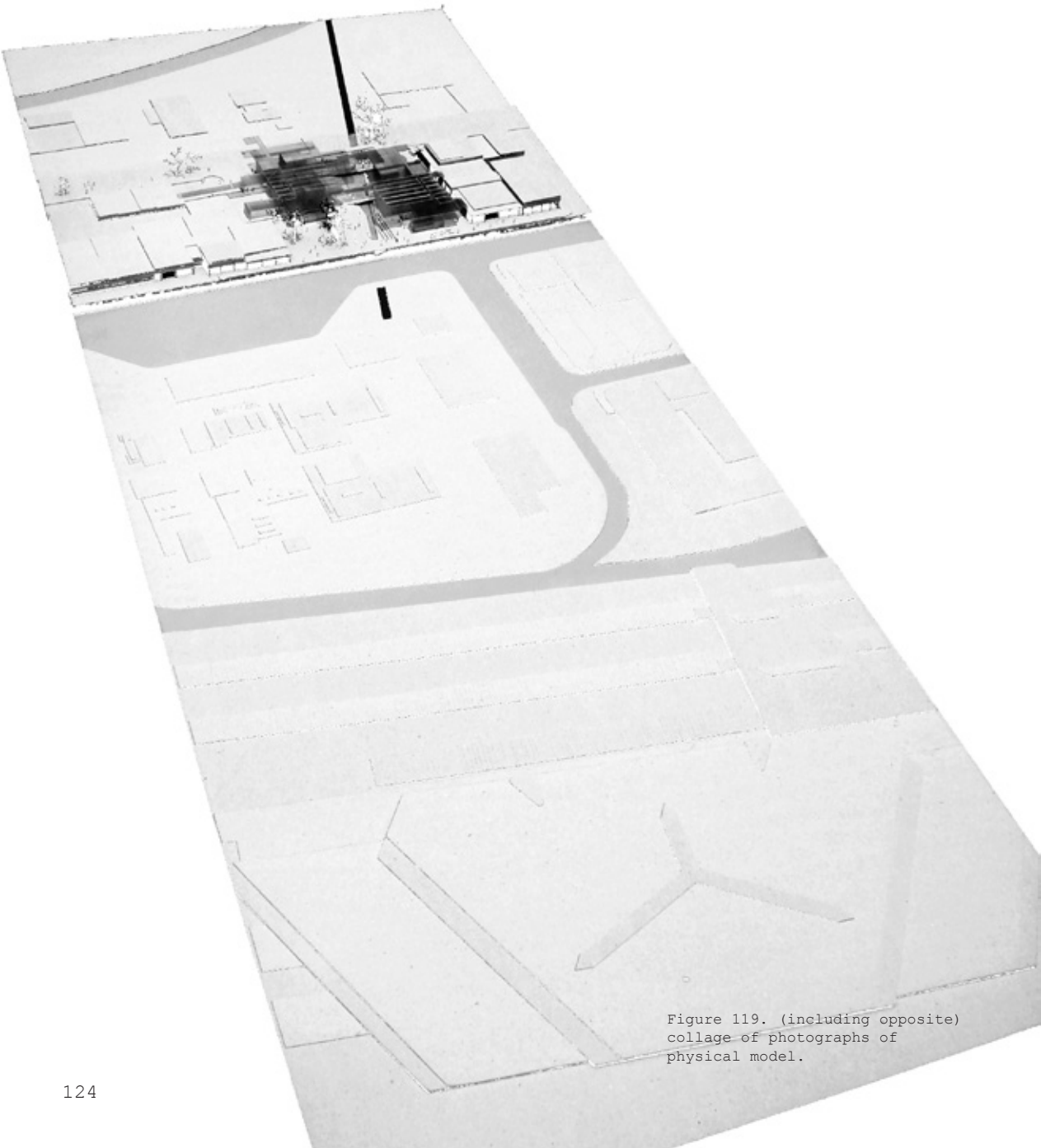
Figure 119. (including opposite) collage of photographs of physical model.