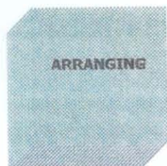
Table 5.8: Unit standards, Ensemble Specialisation Programme (ESP), NQF levels 2-4: Arranging