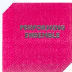
Table 5.9: Unit Standards, Ensemble Specialisation Programme (ESP), NQF levels 2-4: Performing/Ensemble