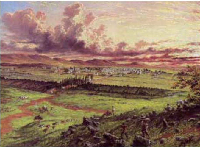
Figure 5.1. Pretoria in 1872 by Thomas Baines shows the current day Lions Bridge towards the city centre.