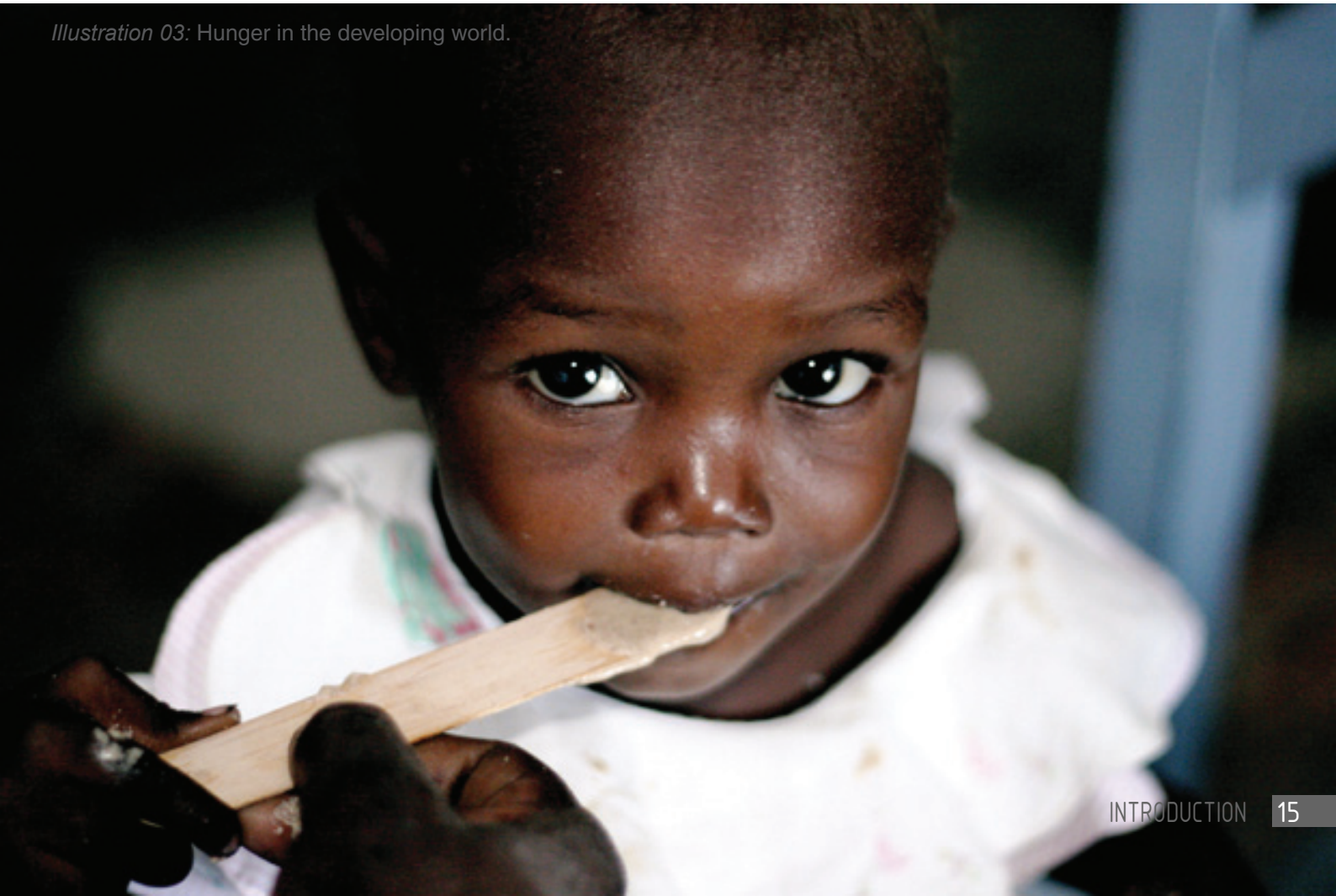
Illustration 03: Hunger in the developing world.