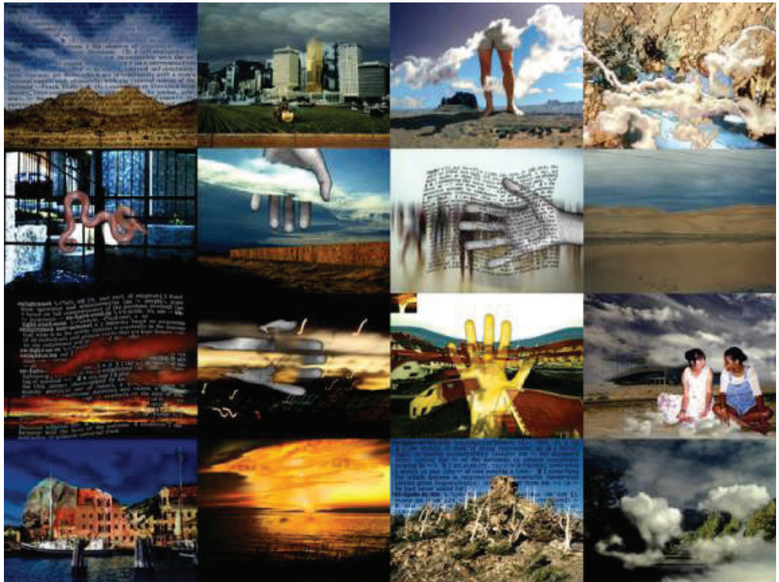
Figure 1.2: (Right) Frames of Mind: Memory Matrix , Vibeke Sorensen ( http://visualmusic.org/Biography/VS-LivingArch.html )