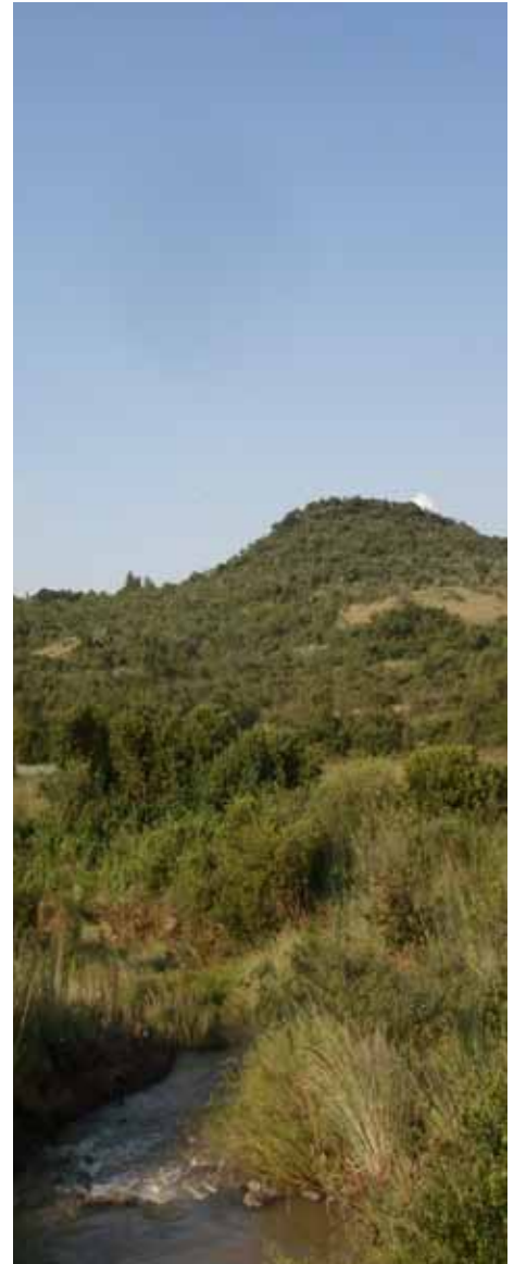
Figure 1.1 Faerie Glen Nature Reserve

A giant Combretum erythrollyllum tree grows slightly off the path – it towers above you and envelops you in a network of its branches creating a cool, shady spot to ponder the splendour of the natural environment that surrounds you. As you look across the grassy plain, wave-like patterns are visible in the grass as the breeze blows through it while it shimmers gently in the sunlight. In the background, the ridge forms an elegantly curved backdrop to the reserve.